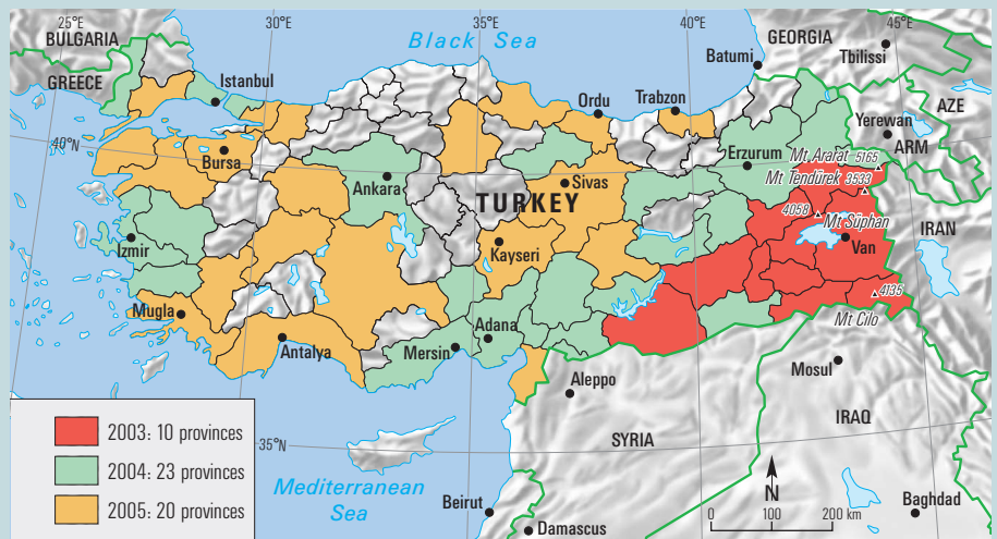
FIGURE 2 Provinces included in the “Off to School, Girls!” campaign, and date of their inclusion. (Map by Mehmet Somuncu and Andreas Brodbeck)

dled at 2 levels: a) The Campaign Central Management Level , at which coordination of the campaign is provided, and the basic decisions are made. The Central Execution Board in the capital city, Ankara, performs this task. b) The Province Implementation Level , which executes activities in the provinces within the scope of the campaign, is comprised of: the boards and commissions established at the level of province, district, village, and town; province consultants; province coordinators; and province and district communication bureaus (Figure 3).