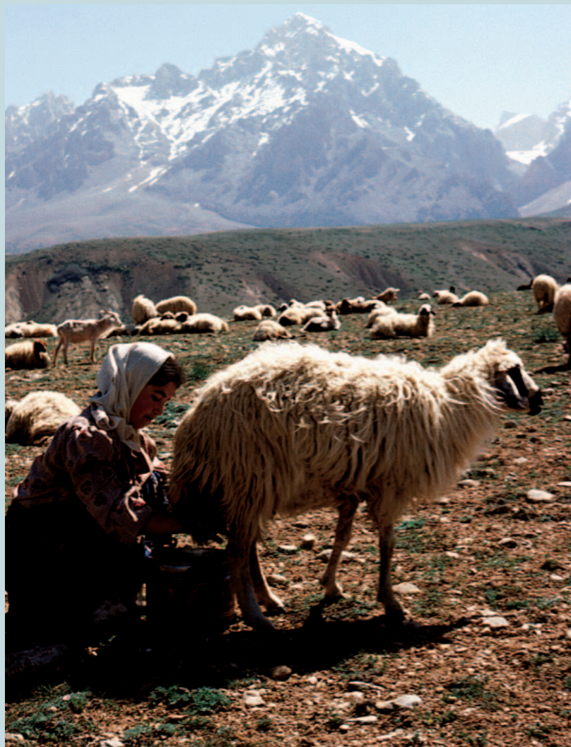
FIGURE 1 Girls in Niğde, in the Taurus Mountains, are forced by their parents to work at home or in the fields instead of going to school.

socioeconomic difficulties work against the basic education of children, especially of girls living in mountainous provinces: