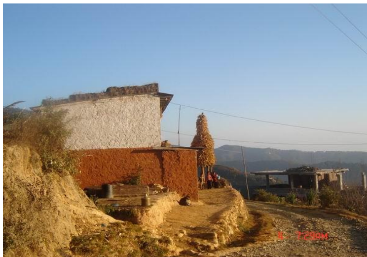
Maize, one of the main foods of the Hill people, stored by Tamang indigenous peoples in the Makwanpur district.

change. IFAD's experience of working in partnership with the Limbus needs to be expanded to other indigenous peoples of the Hills and the Terai, including the Inner Terai. The priority issues identified by the indigenous peoples' movement in Nepal include: awareness raising, ownership and control of land and other natural resources, continuation or revival of indigenous institutions, self-determination, autonomy and self-rule and the mechanism of free, prior informed consent (FPIC).