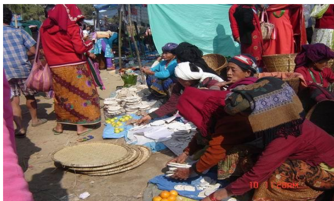
Rai indigenous women of Sankuwasabha selling local yeast cake in weekly market to make their living

All indigenous peoples lost ownership and control over their ancestral lands by the 1960s because of the State's predatory land policies, such as Birta (the rulers gave ownership of land to individual Bahuns) and Jagir (land given in lieu of salary) and of the abolition of Kipat (communal/collective land ownership) land tenure system (Regmi 1977; 1978).