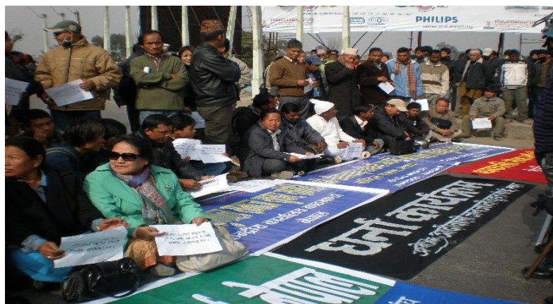
The Indigenous Peoples Mega Front, Nepal in a sit-In at Kathmandu demanding the establishment of a free, prior, informed consent mechanism, a committee on indigenous peoples in the Constituent Assembly and the implementation of ILO Convention 169

Modern indigenous peoples' organizations are expanding at the regional, national and grass-roots levels. These organizations could be categorized in six main groups: