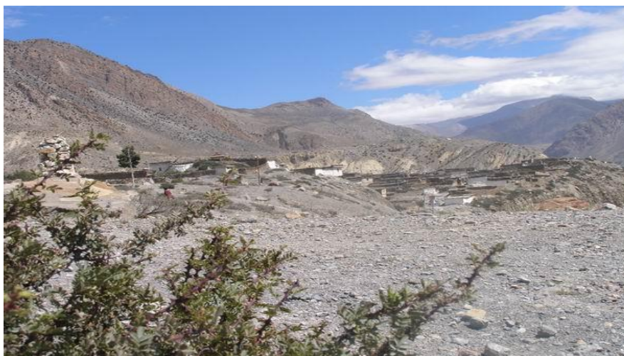
The settlement of the Syang indigenous peoples in the Mustang district.

Indigenous peoples are at different stages in continuing or maintaining their social and political structure (see Table A3 in the Annexes). Indigenous peoples of the Hills and the Terai regions, including Inner Terai, have lost their traditional political system and many parts and aspects of the traditional social structure. For example, the Tharus and other indigenous peoples of the Terai lost control over their ancestral land after eradication of malaria in the early 1950s, and lost their traditional social and political structure with the introduction of the autocratic partyless Panchayat system in 1960. That system had a mission of "One King, One Country, One Language, One Dress", which was a project of homogenization of social and political structures by the dominant caste group. Also, the Limbus of the eastern Hills of Nepal are the last indigenous peoples to lose the Kipat , or the indigenous land tenure system.