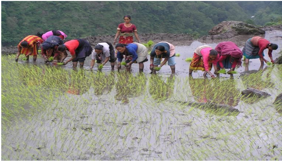
Surel indigenous women planting paddy seedlings in Surel villages in Dolakha district

(g) agriculture and industrial activities. Three indigenous peoples (i.e. Marphalis Thakali, Newar and Thakali) rely partly on agriculture and mainly on industrial activities for their livelihood.