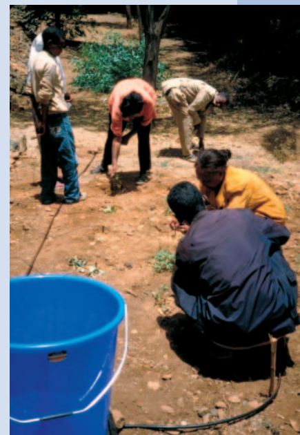
FIGURE 5 Successful use of drip irrigation depends on support from specialists for installation and maintenance.

Last but not least, introducing a new technology means a change in the land use system; therefore, capacity building is essential.