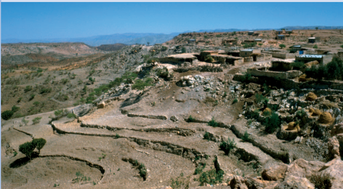
FIGURE 1 Typical farm landscape in the highlands of Eritrea.

Several terms are widely used for drip irrigation: localized irrigation (United Nations Food and Agriculture Organization, FAO), micro irrigation (International Commission on Irrigation and Drainage, ICID), and trickle irrigation