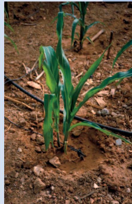
FIGURE 3 View of a drum kit lateral and an emitter applied to a maize crop.

The IDE smallholder bucket and vegetable kits could enable women to be breadwinners (while still respecting traditional obligations) because these kits can be installed in backyards to produce some basic food items. This could improve household living conditions and greatly reduce women's dependence on men. Furthermore, many villages in the high-