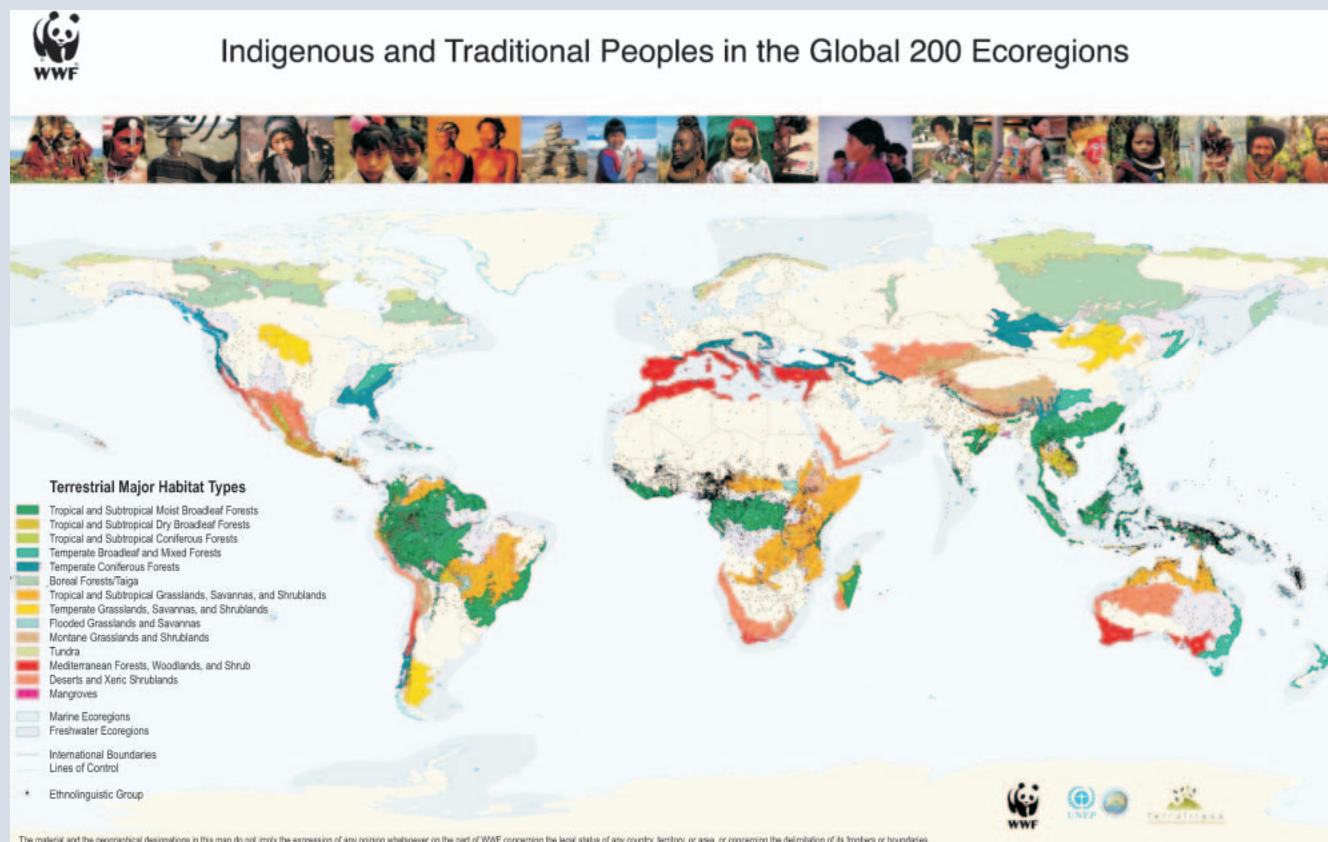
FIGURE 5 The result of a major effort to map biocultural diversity: an online map of the “Indigenous and traditional peoples in the global 200 ecoregions.”

power of speakers of endangered mother tongues, to give the language a strong presence in the education system and to provide the language with a written form to encourage literacy and improve access to electronic technology. Linguistic diversity is, after all, the human store of histori-