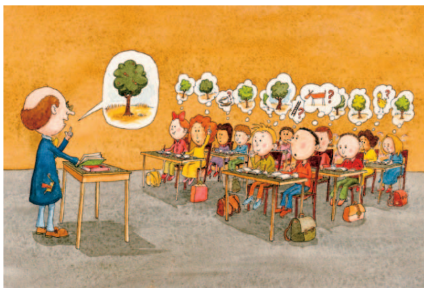
FIGURE 2 Educating Babel: the mother tongue dilemma. While studies show that students learn better through their mother tongue, the language has to be taught in school for the benefits to be reaped, which is rarely the case with minority languages.

This is particularly important because about 476 million of the world's illiterate people speak minority languages and live in countries where children are for the most part not taught in their mother tongue (Figure 2).