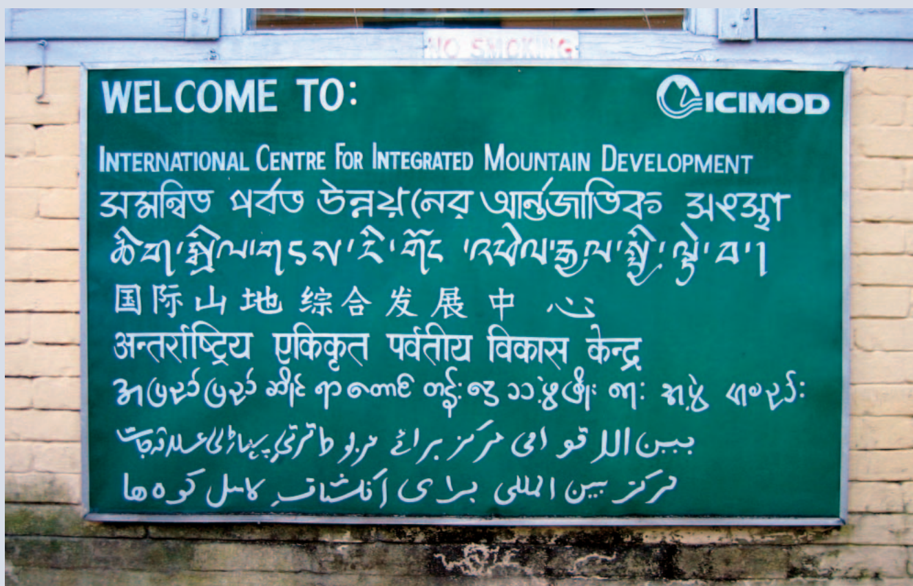
FIGURE 4 “Welcome to ICIMOD” in 8 different languages. The sign at the entrance to the main offices gives an indication of the multilingualism and linguistic diversity of the 140 staff.

Language revitalization campaigns aim to increase the prestige, wealth and