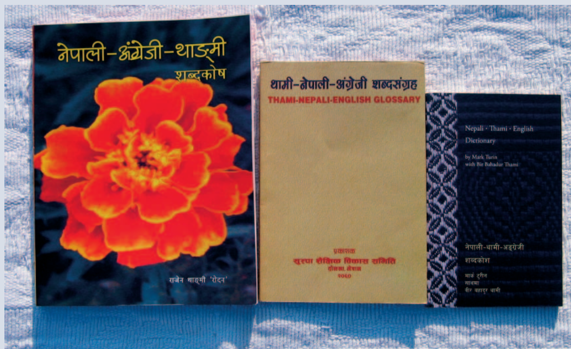
FIGURE 3 Cause for hope: after years of being forgotten by scholars and language activists, the endangered Thangmi language now boasts 3 dictionaries, all of which were published in 2004.

nation state. Ethnic and linguistic differences are also quick to be invoked in times of conflict.