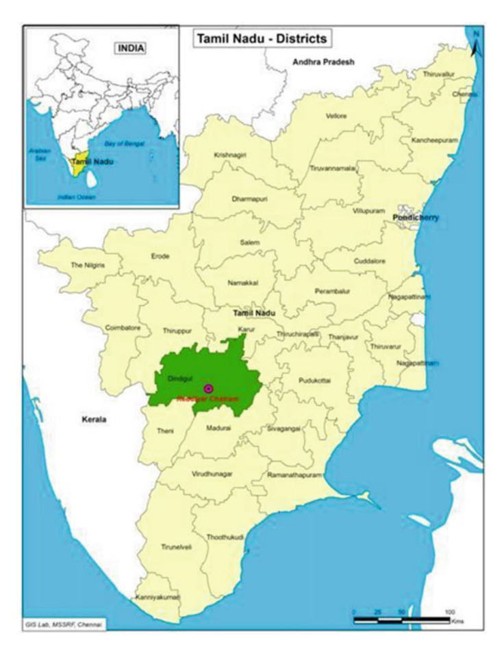
Fig. 18.1 Location of the study area.