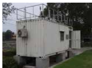
RATNA PARK, NEPAL

AQMSs SETUP BY ICIMOD IN COLLABORATION WITH PARTNERS IN THE HKH