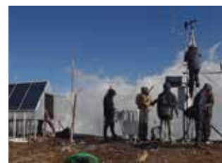
CHELE LA, BHUTAN