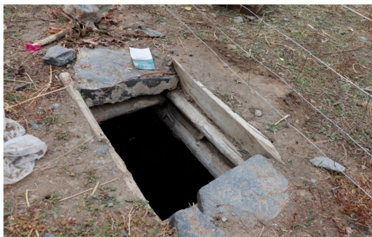
Figure 4. A below-surface earthen tunnel for vegetables cultivation in Misgar.