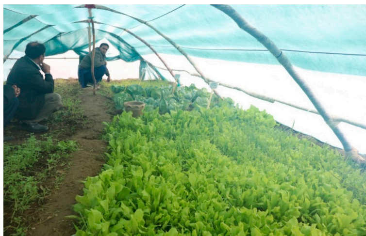
Figure 3. Vegetables cultivated in plastic tunnel in Misgar.

also has a scope to further improve their income from livestock raising and cultivation of diverse vegetables in tunnels (see S2 and S3 in Appendix A Table A2; Figures 3 and 4).