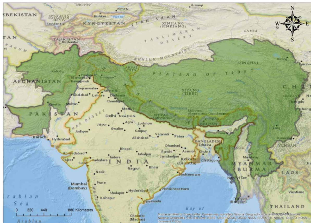
Fig. 1. Hindukush Himalayan region.