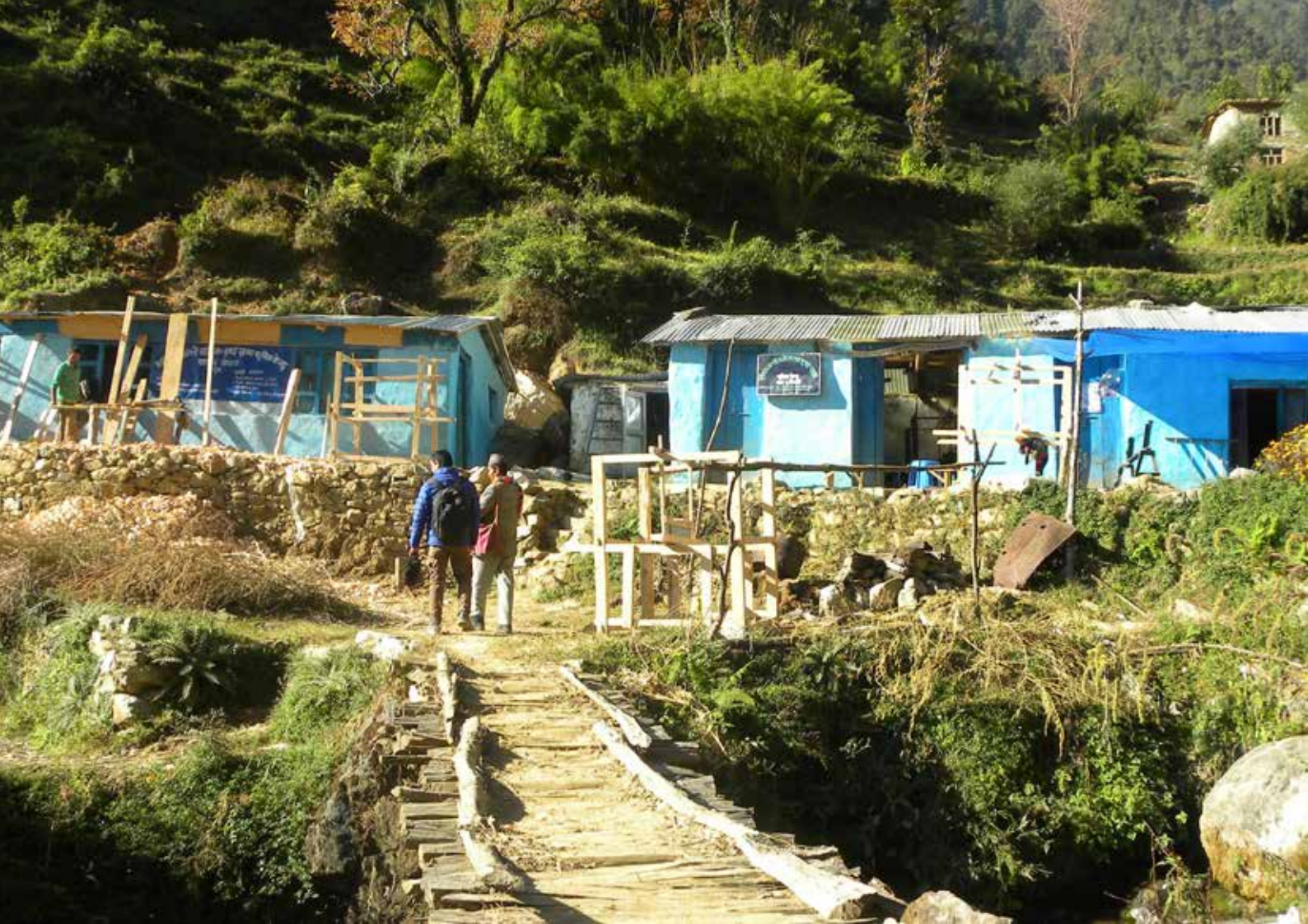
Bhumiraj Allo Processing and Collection Centre, Darchula