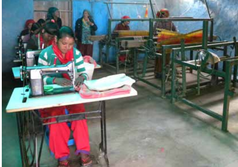
Enterprise Development Model of KSLCDI Nepal (adopted from SABAH Nepal's model)

In 2016, the Bhumiraj Allo Processing and Collection Center was established in Godhani village with support from KSLCDI. Of 23 members, 19 were women. SABAH-Nepal trained the CFC members to strengthen the allo value chain at each node of the intervention and further link producers with the market. Together with community members, a business plan was developed for the CFC. Today, their products have reached markets in Nepal, Japan, Norway, and India where they are sold under the “Kailash Truly Sacred” brand. As of December 2017, there are 82 members in the CFC, 69 of whom are women.