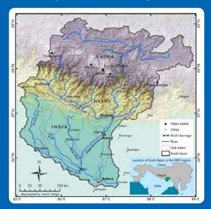
Figure 1: The Koshi River basin spreads over three different countries: China, Nepal and India. While the uplands in China and Northern Nepal are characterized by high elevation terrain, the alluvial plain in Southern Nepal and India are flat and agriculture intensive