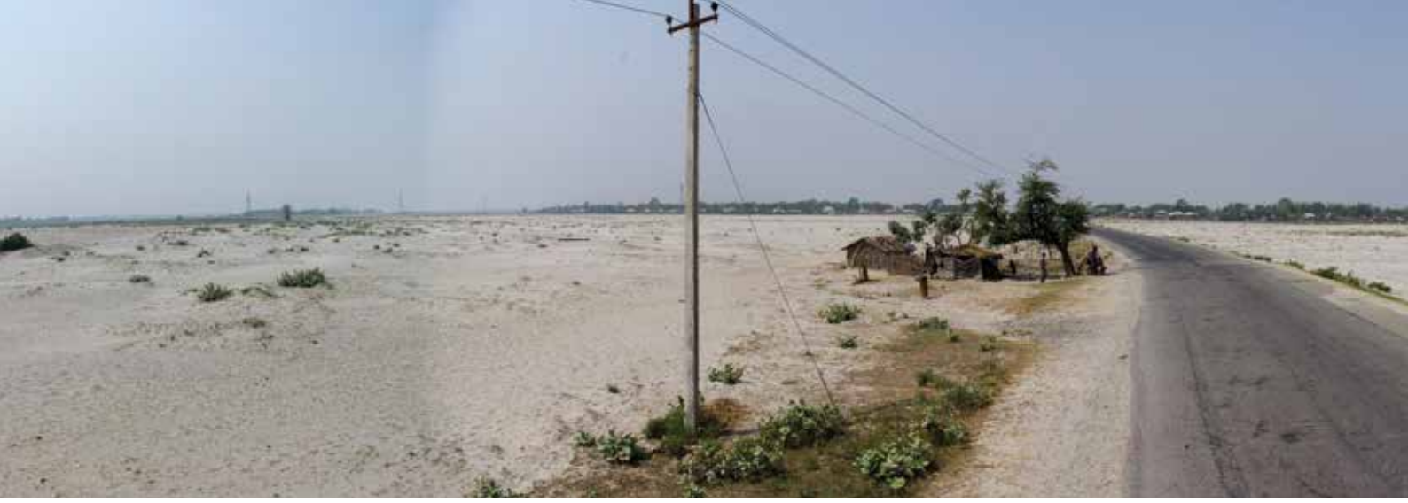
Sand and sediment deposited across the landscape after an embankment breach in 2008. Five years later, in 2013, the land remained unsuitable for farming