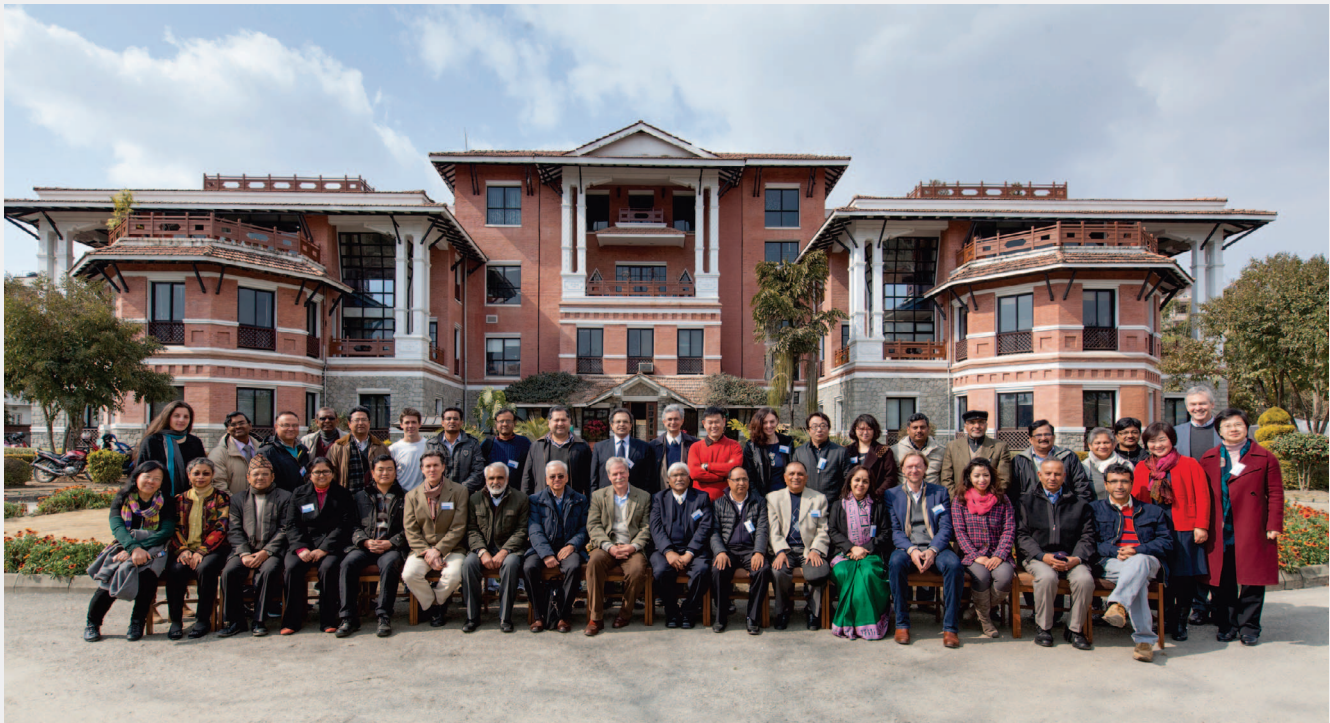
FIGURE 2 Members of the HIMAP coordinating team and steering committee, coordinating lead authors, and ICIMOD chapter anchors, January 2016; photo taken in front of ICIMOD, Kathmandu, Nepal.

Intergovernmental Panel on Climate Change. www.ipcc.ch/report/ar4/ ; accessed on 12 March 2016.