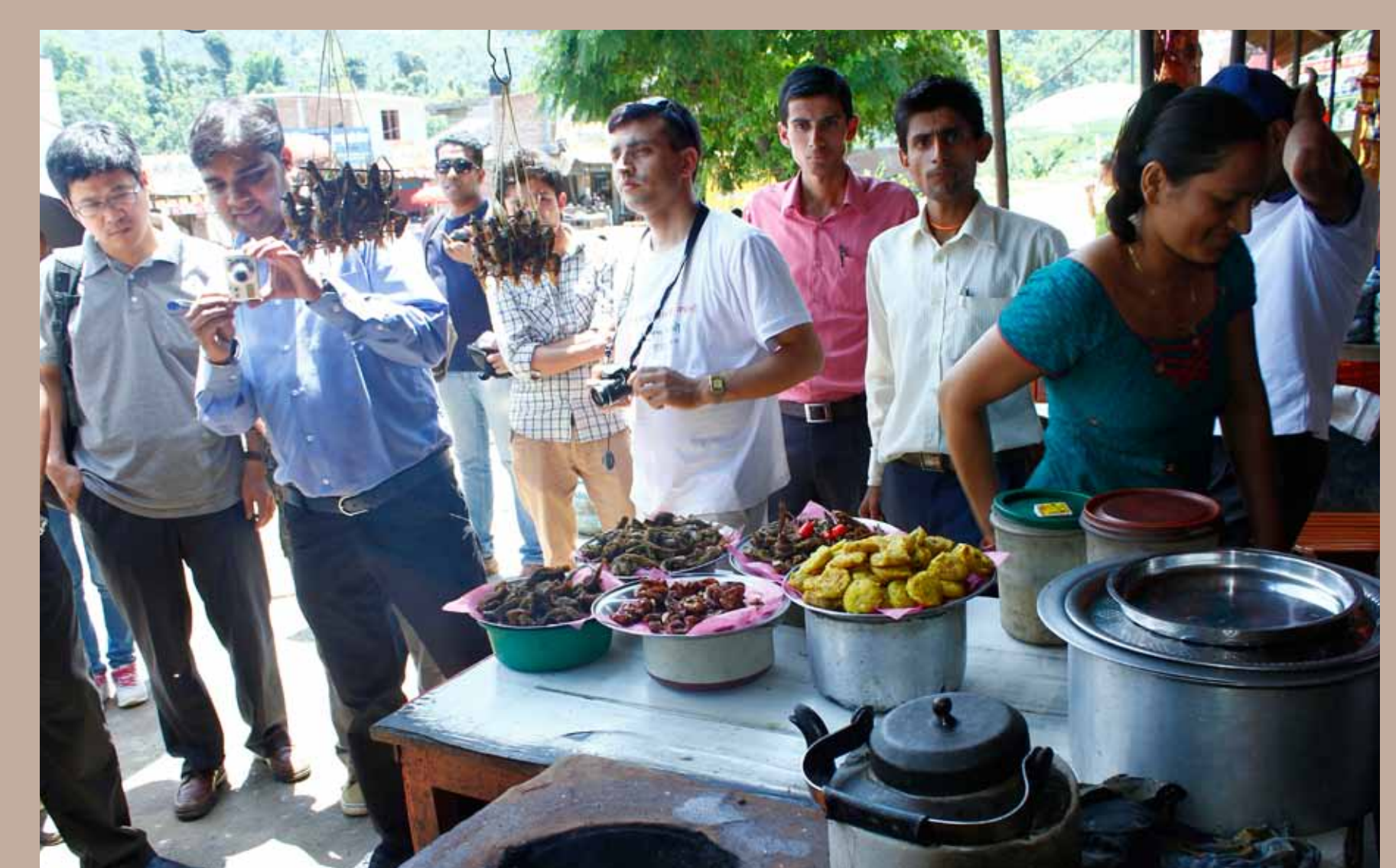
Field visit for delegates