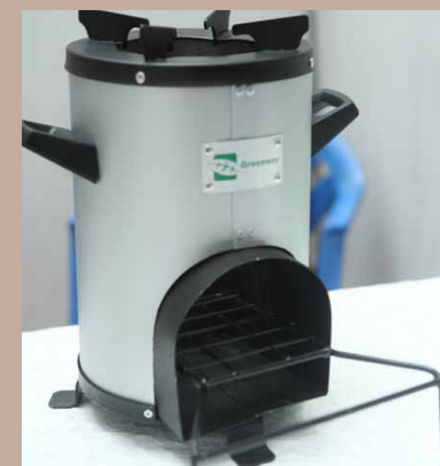
Stove's Live Demonstration