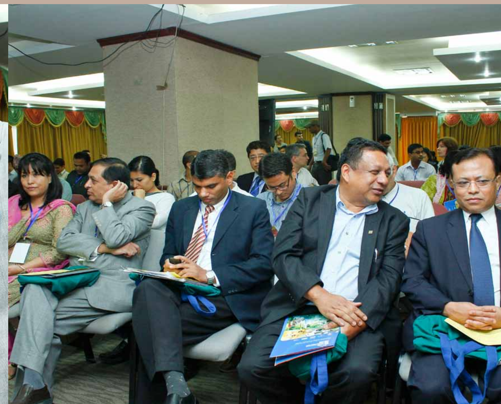
National and international participants