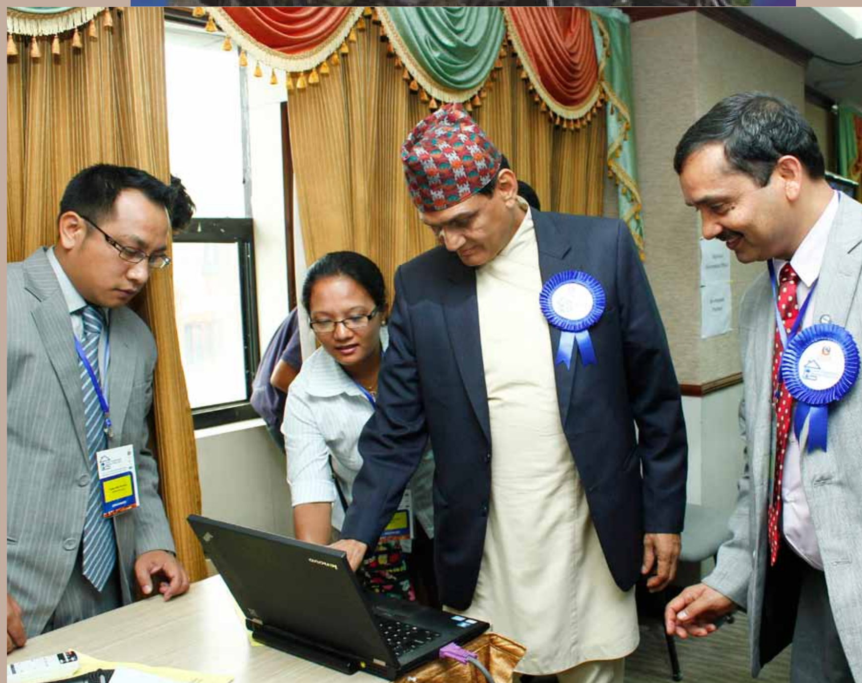
Launching of NACC