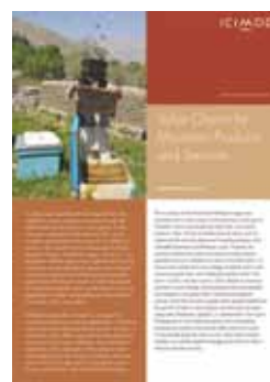
Value Chains for Mountain Products and Services, IS 3/11

Black Carbon in the Hindu Kush-Himalayan Region, IS 2/11