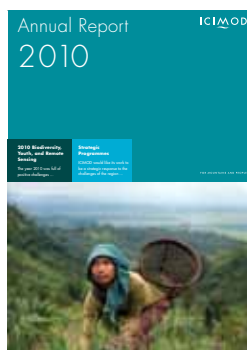
ICIMOD Annual Report 2010