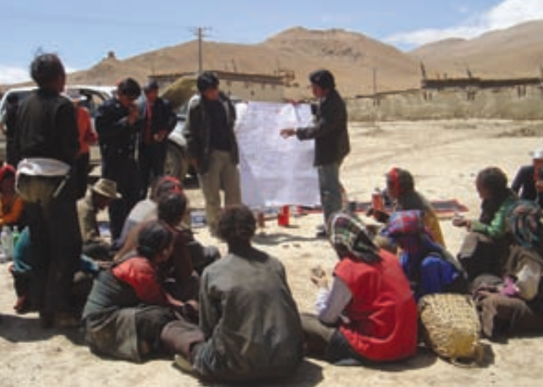
Rangeland community discussion, TAR, China

changes for many people and create a lot of work in communicating with stakeholders, and changing requirements and behaviour. In particular, innovations 'not invented here' should be explained, accepted, and prove their benefits before they can be implemented.