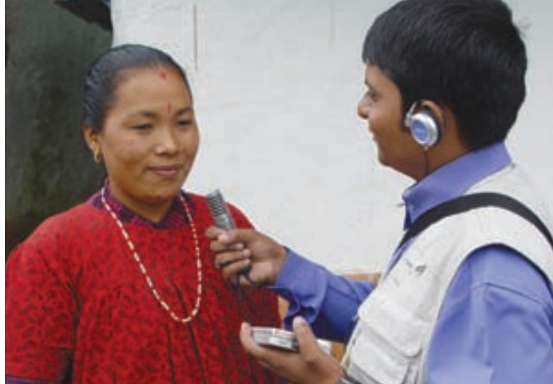
Bhattedanda, Lalitpur, Nepal