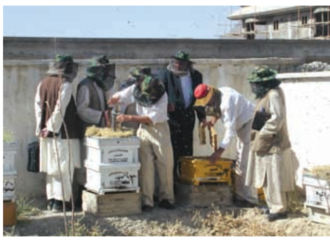
Training Afghan beekeepers in Kabul

It is important to keep vigil and regularly inspect the bee colonies to be aware of the presence of a queen, eggs, and food stores such as nectar and pollen, to check and monitor the space for bees within the colony, and to note colony status (colony health and hygiene, presence of queen