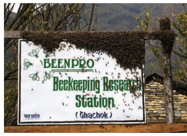
Swarm of apis cerana