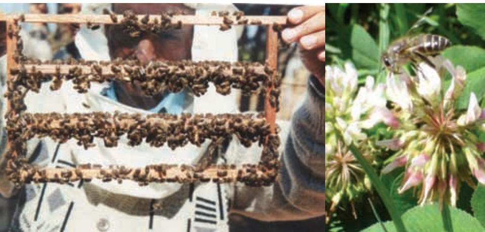
Observing queen cups of apis cerana during queen rearing

Queen rearing is an artificial way of raising queens. The queen lays fertilised eggs in smaller worker cells and unfertilised eggs in larger drone cells. Fertilised eggs are capable of developing into a worker or a queen, depending on the types of cell it is developing into and the type of food it ingests. An egg laid in a worker cell can be moved into a queen cell and can develop into a queen and vice versa. The quantity and quality of food given to a developing larva determines whether it will rear a worker or a queen bee. By merely changing the queen in a colony, one can strengthen and change the characteristics of the colony.