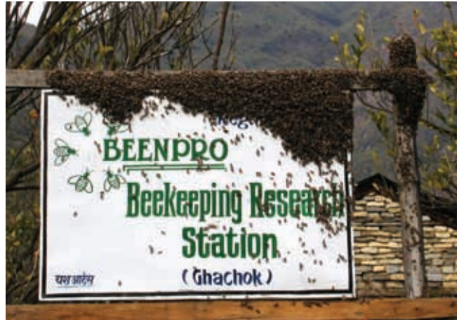
Swarm of apis cerana