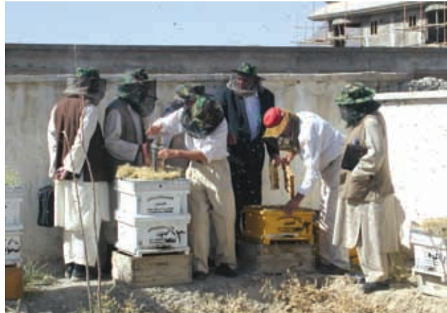
Training Afghan beekeepers in Kabul

It is important to keep vigil and regularly inspect the bee colonies to be aware of the presence of a queen, eggs, and food stores such as nectar and pollen, to check and monitor the space for bees within the colony, and to note colony status (colony health and hygiene, presence of queen cells and drones, any signs of absconding, and presence of stores of honey). Colony inspection time varies depending upon location. It is advisable to inspect colonies only on sunny and clear days.