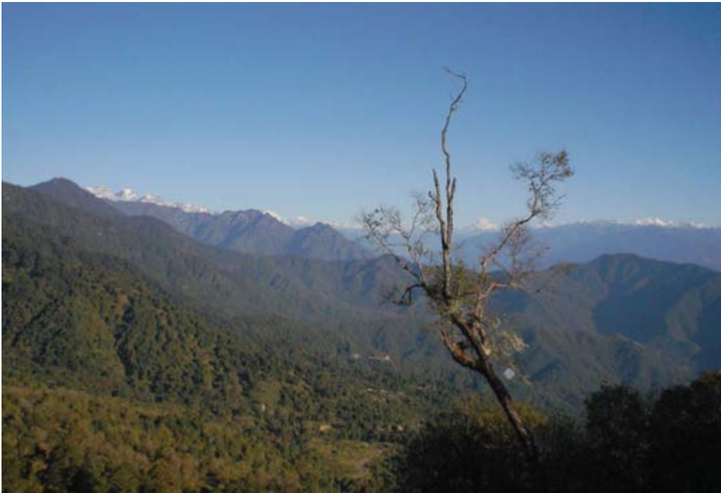
A stretch of the Himalayas as seen on the way to Bumthang, Bhutan.