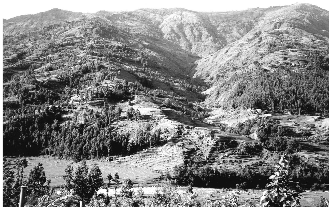
FIGURE 3 General view of the Dee subcatchment of the Likhu Khola (visible in the foreground), with khet terraces on the lower slopes and patches of woodland and bari terraces on the higher slopes. A few landslide scars are visible.

relatively gently outward-sloping rainfed terraces, frequently with a ditch at the back of the terrace to minimize overland flow and erosion. Khetland represents the system of irrigated terraces usually used for the growing of rice (Figure 4). It is important to make the distinction between double-irrigated and single-irrigated khetland. Double-irrigated khetland produces 2 rice crops, 1 during the premonsoon period and 1 during