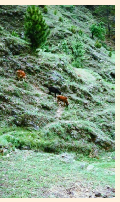
FIGURE 3 Common land under the control of the Revenue Department, Uttar Pradesh Government, 1993.