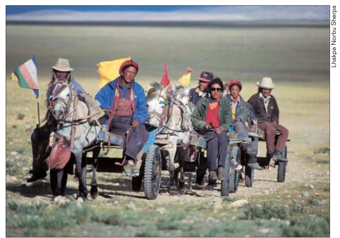
People of Tingri, TAR, cross-border traders

transboundary World Heritage sites and would provide unique opportunities to conserve both natural and cultural heritages across an international boundary. World Heritage designation is also an important tool for increasing awareness and raising funds.