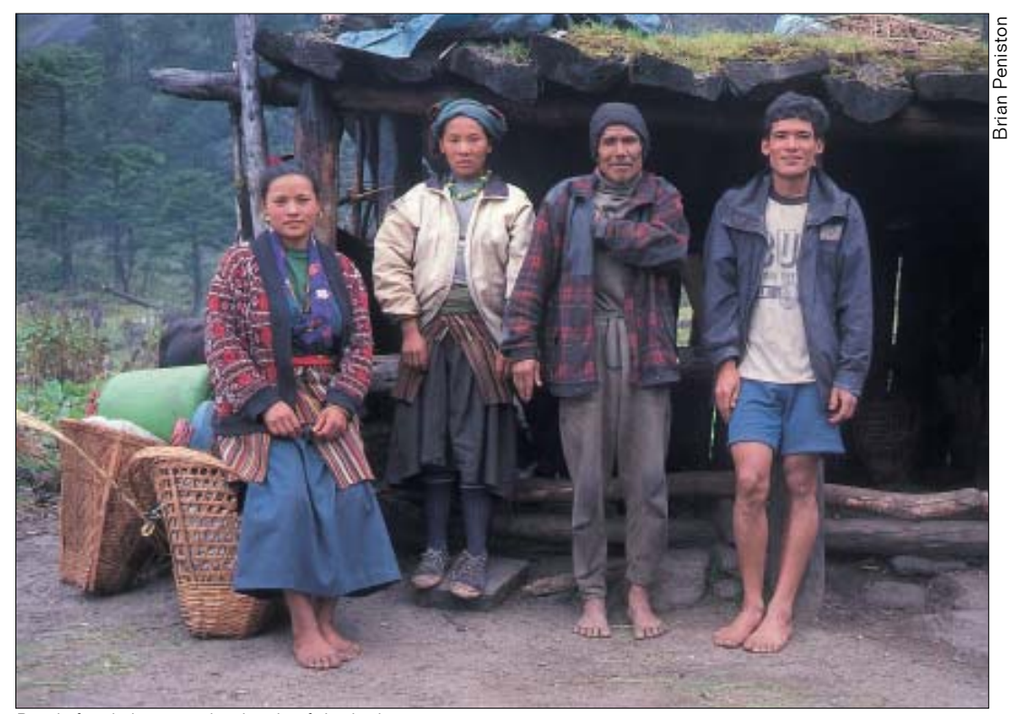
Ready for dialogue - shepherds of the high pastures

The participants in the ecotourism workshop ranged from villagers to Lhasa-based forestry officials; it was difficult to design activities for such a diverse range of participants.