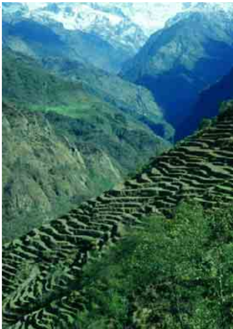
Figure 3.1: Terrace systems below Annapurna – an enduring feature of the Himalayan mid hills of Nepal.