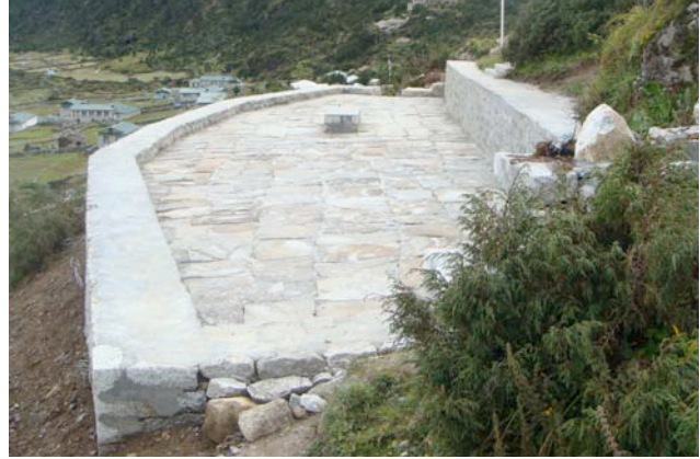
Worship platform completed

The local people felt that the existing site has become very congested due to increased population and needed to be expanded and restored to allow the whole village to perform the pujas in a comfortable manner. By expanding and restoring this site for better management not only lead to keep traditions alive but also helps to protect the depleted forest especially the juniper forest surrounding the areas. In order to complete the project for expansion, TMI with Tourism Cares for Tomorrow support allowed the local people to: