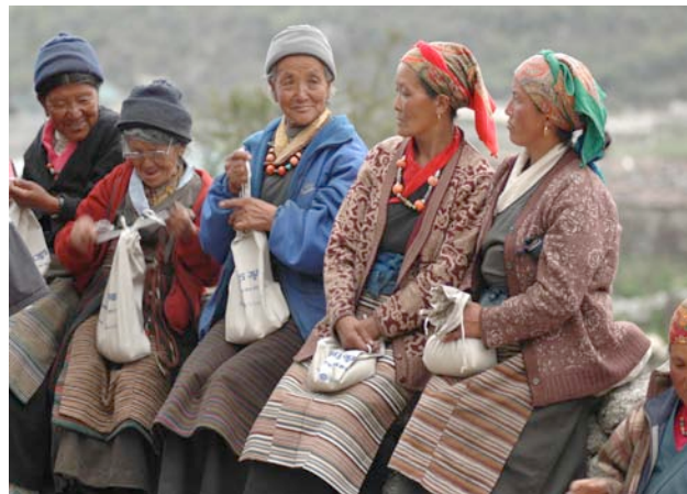
Local women with cloth bags

Environment conservation of the Khumbu region is one of the major objectives of Sagarmatha National Park and Buffer Zone. Littering is a much-publicized problem in the National Park and garbage produced by trekking and mountaineering has caused significant environmental problems. With support from Ford Foundation and the Tourism Care for Tomorrow, TMI developed guidelines to reduce the use of plastic bags replacing them with reusable cloth bags, linking cultural conservation and environment conservation. This system of using cloth bags during festivals has been replicated in several Gompas throughout Khumbu.