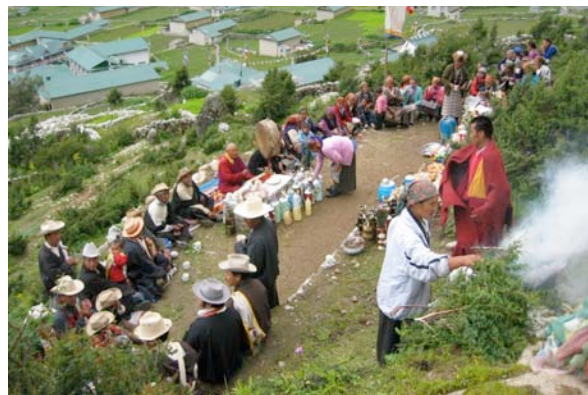
Worship before the project

In Khumbu region, there is a custom of worshipping the protector of the region i.e. Khumbu Yulha in collective manner by villagers. This ceremony is performed in a special sacred area up in the mountains. This festival is carried out before the Sherpas take their livestock up in the pasture. Tourism Cares funding was also specifically used to conduct this program.