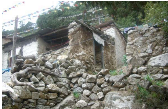
Before the support

Tewangma nunnery in Pangboche was established 350 years back by Lama Sangwa Dorji, who introduced Buddhism to Khumbu, near the end of the 17 th century. This is one of the poorest yet historically significant sacred institutions of the Khumbu region that is in disrepair. Most of the Tourism Cares funding was used to conduct this restoration program.