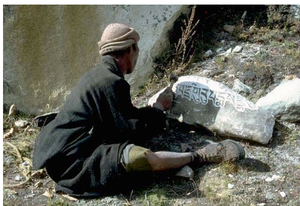
Mani carving in Monju

The Sagarmatha Women Group (SWG) of Chaurikharka -1 has restored the Mani wall 2 starting from Phenkar with self-initiatives. The SWG has restored the Mani wall after seeing the successful restoration that took place in Khunde, Khumjung villages with the aim to conserve the environment, local culture, and religious and to empower. Besides the Mani wall restoration, the SWG also has been engaged in garbage collection and clean-up activities to raise awareness among people in environment conservation.