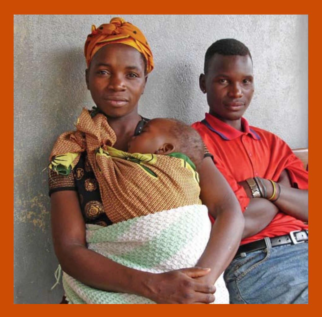
Photo: Proud Mum and Dad after a routine checkup at Machase District health clinic in Mozambique. Mother and baby are in good health.

Mozambique needs significant additional financial support to make health care free and to address the severe health worker shortages. Estimates suggest, in the first instance, an additional US$10 million per year is required for user fee removal and to make medicines free,<sup>57</sup> with further increases necessary to fully implement Mozambique's already fully costed health worker strategy. A US$10 million increase constitutes a 25% increase in national government spending on health as compared to an insignificant 2.5% increase in current levels of aid for health in that country. Despite being a signatory to the International Health Partnership,<sup>58</sup> under which aid donors have committed to scale up funding for national plans, no action has been taken to date to fill this identified financing gap.