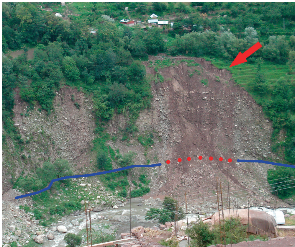
FIGURE 6 Kathai irrigation canal (blue line); most critical section for rehabilitation (red dots) with highly unstable slope above (arrow). (Photo by Markus Zimmermann, 3 July 2007)