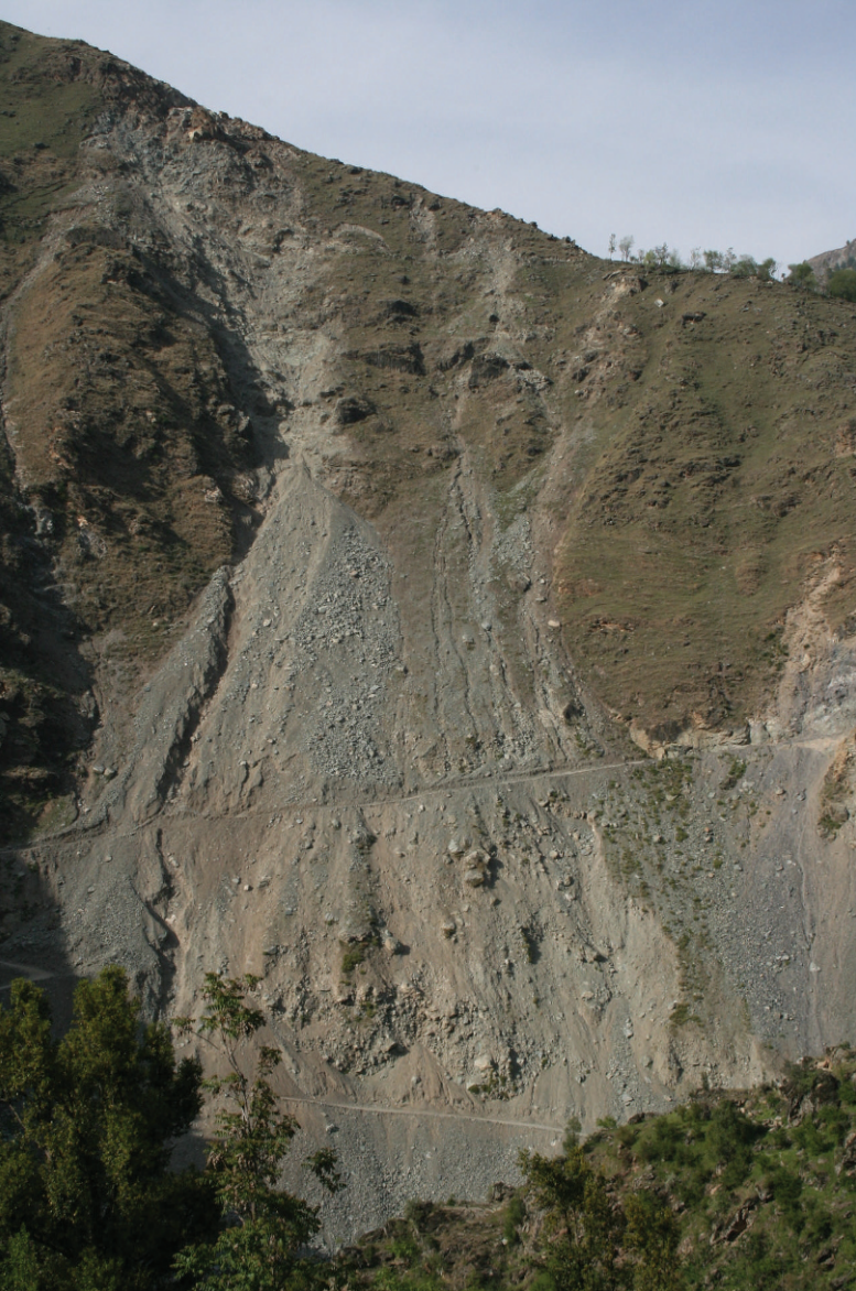
FIGURE 3 Landslide affecting the road to the upper Chakhama Valley. (Photo by AKDN, 4 April 2007)