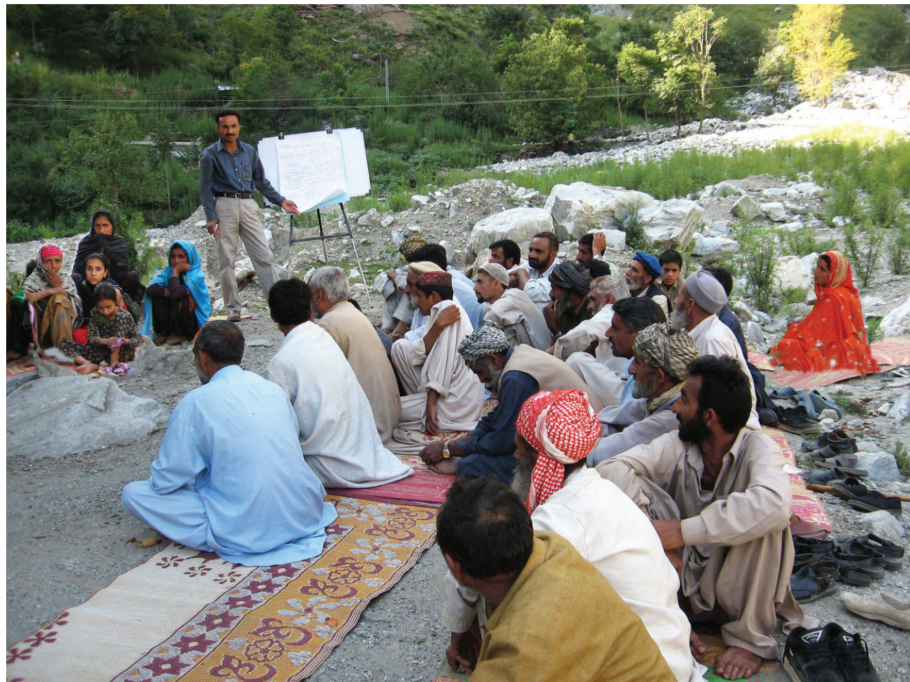
FIGURE 5 Discussion of localized hazard assessments with communities in one of the villages. (Photo by AKDN, 12 September 2007)

crossing of countless rivulets and gullies constitute a major challenge for engineers. The sites of particular structures (schools, basic health units, water supply systems) were assessed and recommendations made to enable engineers to choose appropriate locations and improve overall structural safety (see Box 1). Linear structures (canals, roads) were systematically checked for geotechnical threats (slope failures, landslides, rockfall, debris flows). Each section that was prone to failure was described, and recommendations were outlined (see Box 2).