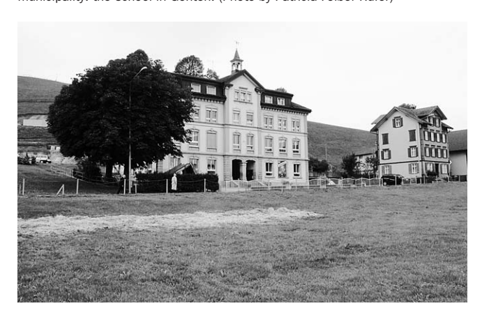
FIGURE 3 Example of a landscape element important for an individual.

It became apparent that landscape elements have distinct collective meanings as well as different meanings for individuals. These meanings are driven by collective or individual value systems. Apart from the above-mentioned common landscape elements, this holds true in particular for landscape elements that are specific to a certain region or municipality. Examples include schools (Figure 2), distinct typical houses, and natural landscape elements. The results revealed that strong feelings existed regarding all kinds of "unspec-