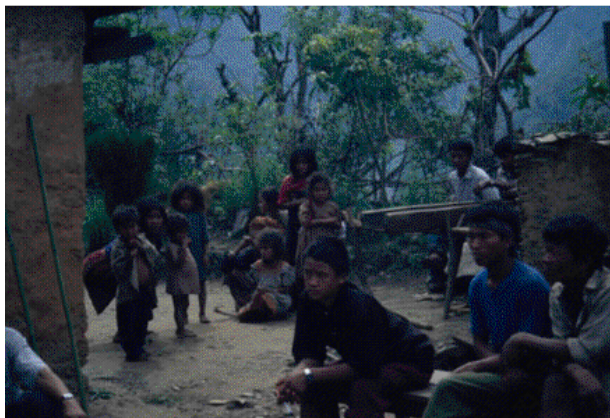
Figure 1: Chepang people training in the Kandrang Valley with an oil expeller in the background.

The Chiuri tree is a medium sized tree native to Nepal. It grows mainly in the sub-Himalayan tracts on steep slopes, ravines and cliffs at an altitude of 400 to 1400 meters, particularly in the Chitawan district. Its botanical name is Diploknema butyracea Roxb syn. Bassia butyracea , syn. Madhuca butyracea , syn. Aesandra butyracea ). It is also named "butter tree". The main product of the tree is "ghee" or butter, extracted from the seeds and named "Chiuri ghee" or "Phulwara butter".