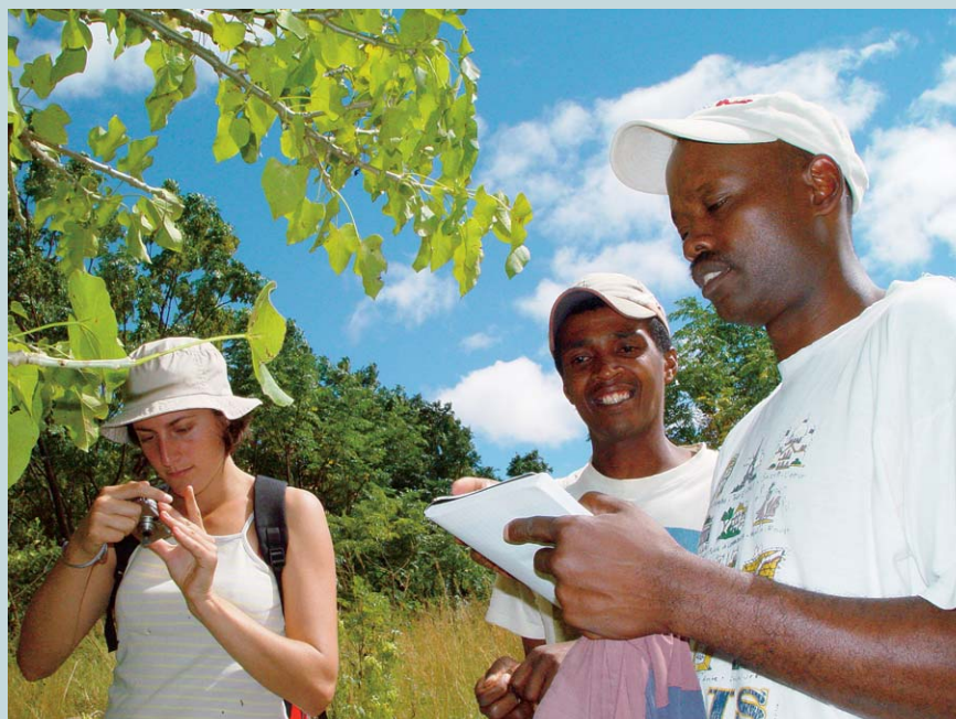
FIGURE 5 Research and development on the botanical circuit in Anjà. Villagers work together with a national botanist and international students.

a leader with a vision of communal economic development.