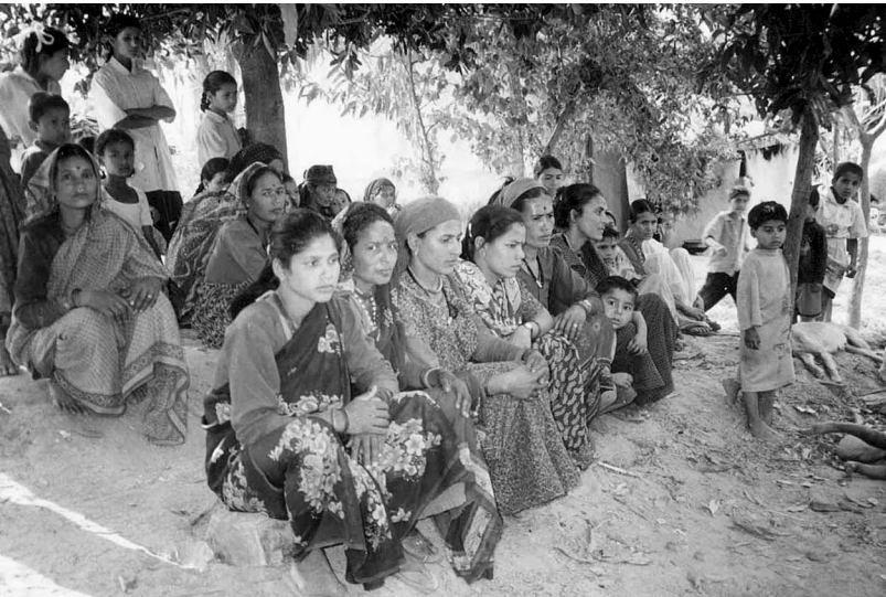
FIGURE 2 Women of the Brahmin and Chhetri castes in Pawoti village, Dolakha District, discuss a dispute over a drinking water source in order to settle the conflict between two communities informally.

politicians use FUGs as a platform for political gain. Conflict between the Federation of Forest Users and the Forest Department became severe when the government took over some of the authority and responsibility granted by the Forest Act to the users of community forests.