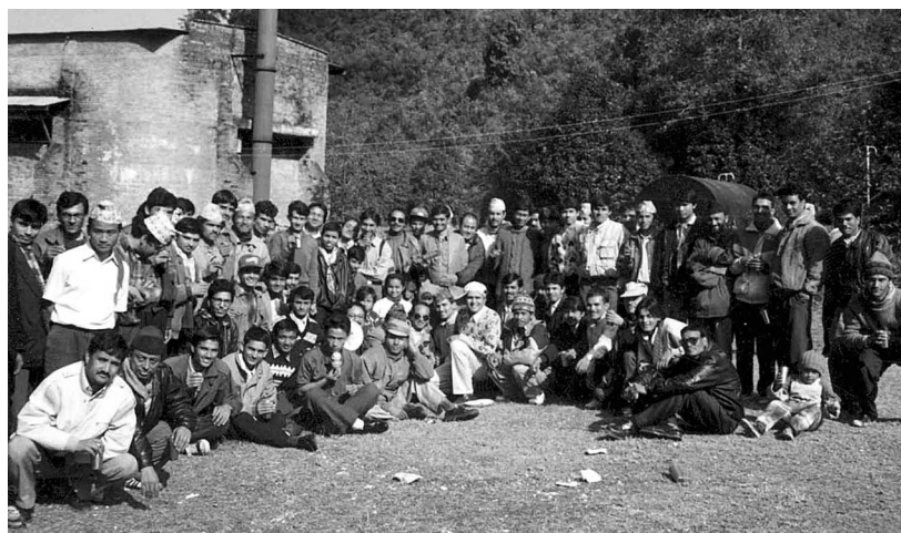
FIGURE 3 Community members meet to discuss a forest-related conflict in a formal process of conflict resolution in Pawoti village, Dolakha District, in 1999. This meeting was organized by the local Village Development Committee. Typically, women are absent.