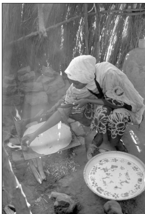
A woman cooking on an open fire in Sudan.

The WHO and World Bank measure health risks according to a disability-adjusted life years (DALYs) formula. DALYs estimate life years lost from disease and injuries and the subsequent disability over the remaining years. It is a measure that allows comparison of health interventions across various life threatening diseases.