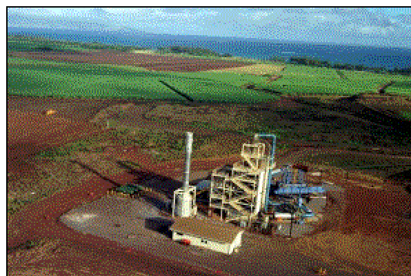
Residues from crops can be gasified and combusted to provide heat and power. (Photo courtesy Warren Gretz and NREL.).

Bioenergy projects can be built in a wide range of sizes and for a wide range of applications. Projects can be as large as 100 megawatt (MW) power stations generating both electricity and heat. Bioenergy projects can also be small enough to produce the lighting and cooking energy for a single household or village. At this level, one of the