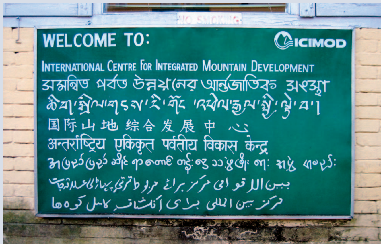
FIGURE 4 “Welcome to ICIMOD” in 8 different languages. The sign at the entrance to the main offices gives an indication of the multilingualism and linguistic diversity of the 140 staff.

Language revitalization campaigns aim to increase the prestige, wealth and