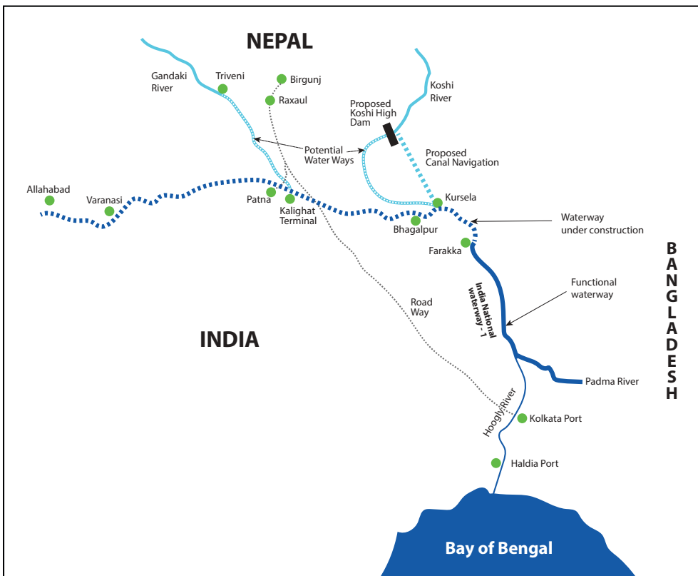
Figure 2. Potential waterways to connect Nepal with the Bay of Bengal.

Regional cooperation for the development of waterways has gained momentum in South Asia (Haran, 2018). Recently, the government of India declared 106 additional waterways and amended the bilateral navigation protocol between India and Bangladesh to allow third countries to use their waterways. Waterways along the Brahmaputra and Ganges Rivers could provide a basis for sub-regional connectivity for South Asia, connecting Bangladesh, Bhutan, the north-eastern states of India, and Nepal to the sea via the Ganges-Brahmaputra-Meghna basin. Nepal could be directly connected to the ports of Haldia and Kolkata through India's National Waterway 1 (Figure 2), Bhutan could be connected through the Manas River to the Brahmaputra at the Jogighopa confluence, and north-east Indian states could be connected to many ports on the Brahmaputra through National Waterway 2 (Figure 3). The best option for Nepal is likely to be linking by road to the proposed Kalighat terminal (Figure 2), which would substantially reduce the distance and cost of transportation to the ports of Haldia and Kolkata compared to current road and rail links. The proposed Koshi High Dam offers