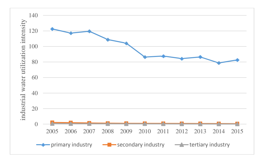
Figure 2. Changes in the water utilization intensity of three industries in Tianjin during 2005–2015.