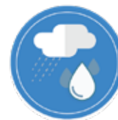
Water and Air