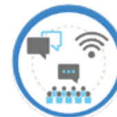
Knowledge Management and Communication