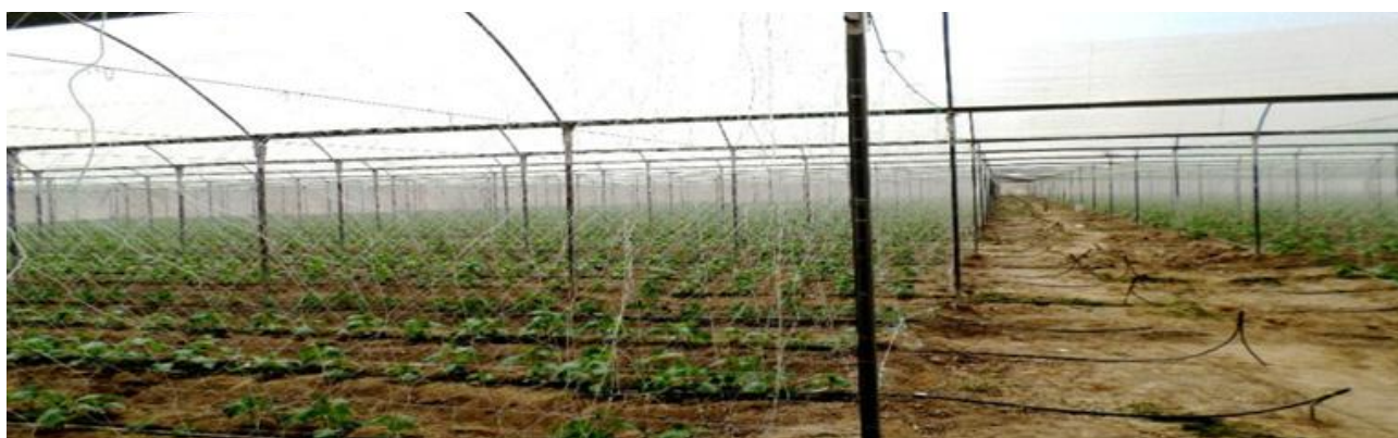
Figure 4: showing drip irrigation system and components in Chaj Doab

Food and livelihood security for growing populations is one of the essential global challenges (Seckler et al., 1998). Food security, droughts, energy crisis and water scarcity are the major problems also faced by many communities in Pakistan. In reaction to the water, energy, food security and other climate related impact, different Resource Conservation Technologies (RCTs) are being developed and supported by national and international organizations, especially for rice and wheat which together make up to 90 percent of the country's total food grain production (Ahmad et al., 2007). These technologies comprise of zero tillage, bed/furrow planting, high efficiency irrigation systems (HEIS), laser land leveling and improvement of irrigation schemes (PARC-RWC 2003). Among the technologies, zero tillage, HEIS and laser land leveling are so far most widely adopted in Pakistan, with use centered in Punjab and other rice-wheat cropping systems (Hobbs and Gupta 2003). Water saving technologies can play an important role in saving water, viable use of water and increasing productivity.