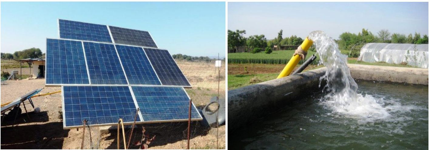
Figure 3: showing solar water pumping in Soan

Pakistan is facing severe water crisis and its water demand per capita is increasing day by day. Soan basin is a rain fed area and its irrigation practices are highly dependent on rainfall but due to environmental and climatic