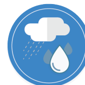
Water and Air