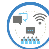
Knowledge Management and Communication