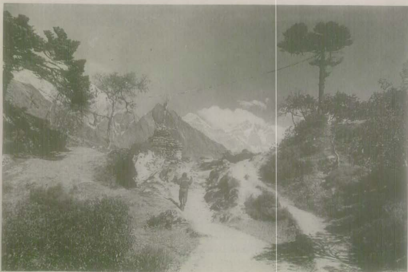
Sagarmatha National Park in Nepal is both home to the Sherpa people and a popular tourist trekking spot. To protect the area's fragile mountain environment sound management must balance social, economic and ecological values.

The programme for the Workshop will include a study tour to the Royal Chitwan National Park, Nepal. In addition a special exhibition in Kathmandu will feature posters, publications, photographs, and various audio-visual presentations relating to the themes of the Workshop.