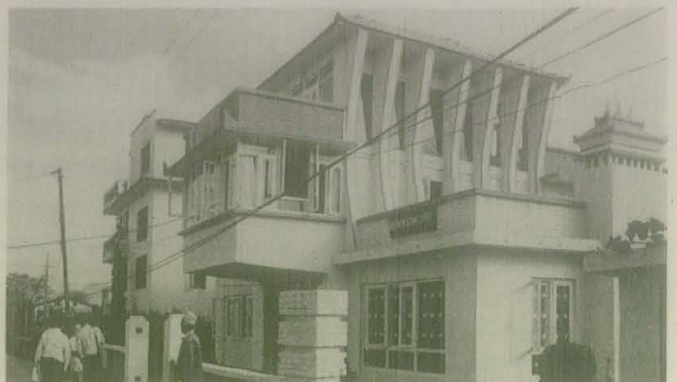
This Building Houses Programme 5, and on the ground floor is the Library.