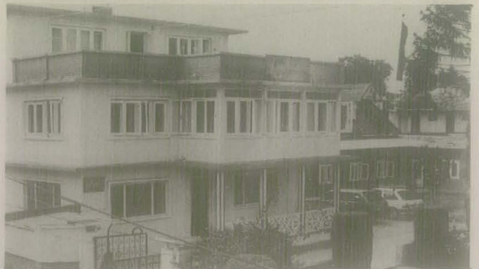
This Building houses Programme I and the Conference Room.