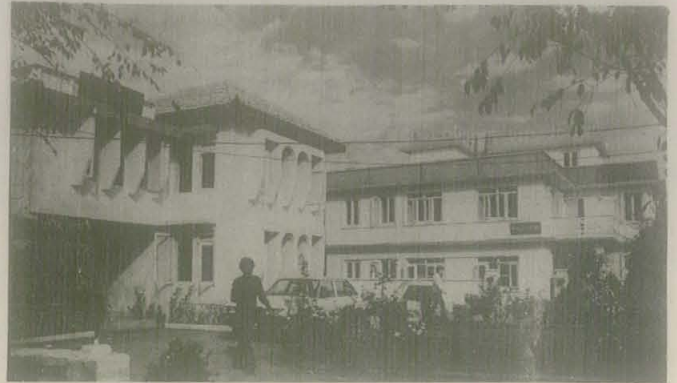
The Central Office (Left) - The Building on the Right Houses Programmes 2 and 3