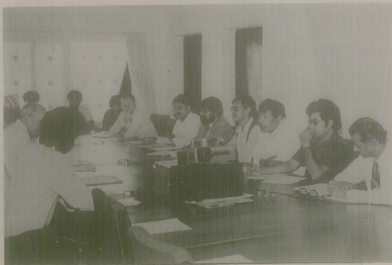
A Staff Discussion Group