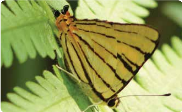
Striped Punch – outer wing