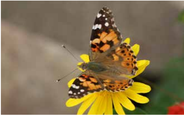
Painted Lady – inner wing