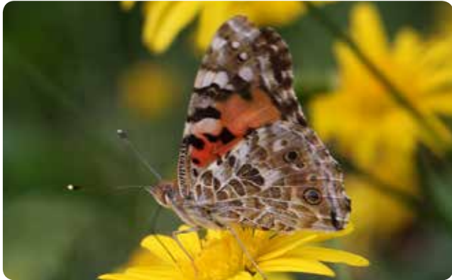
Painted Lady – outer wing