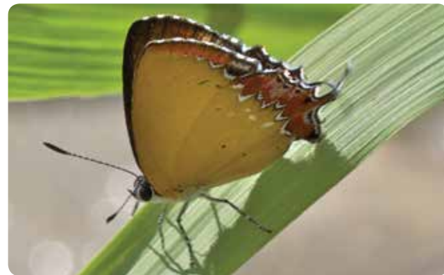
Purple Sapphire – outer wing