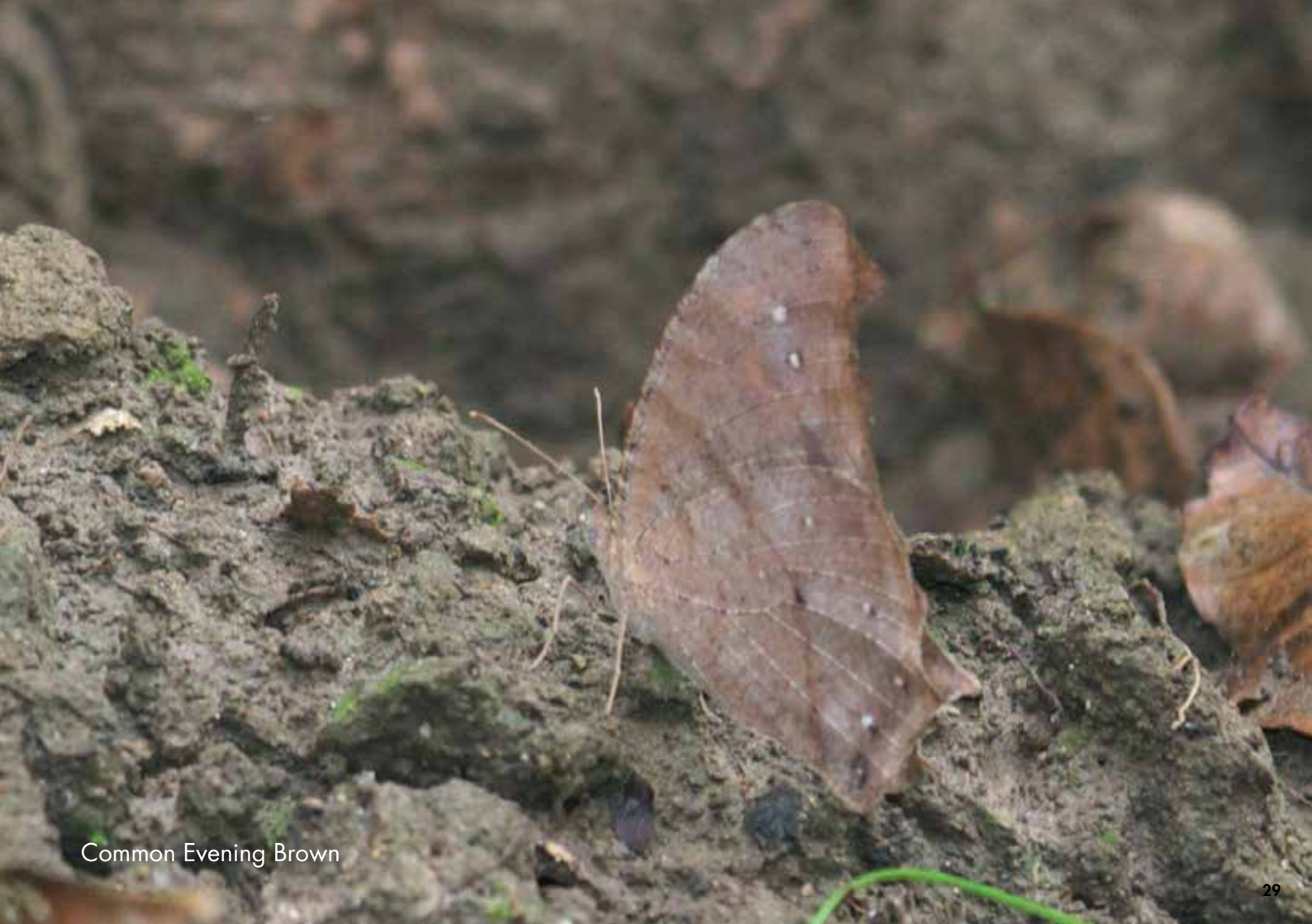
Common Evening Brown