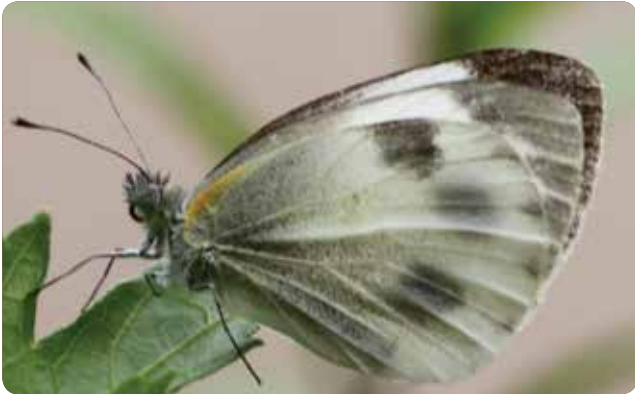
Indian Cabbage White Female