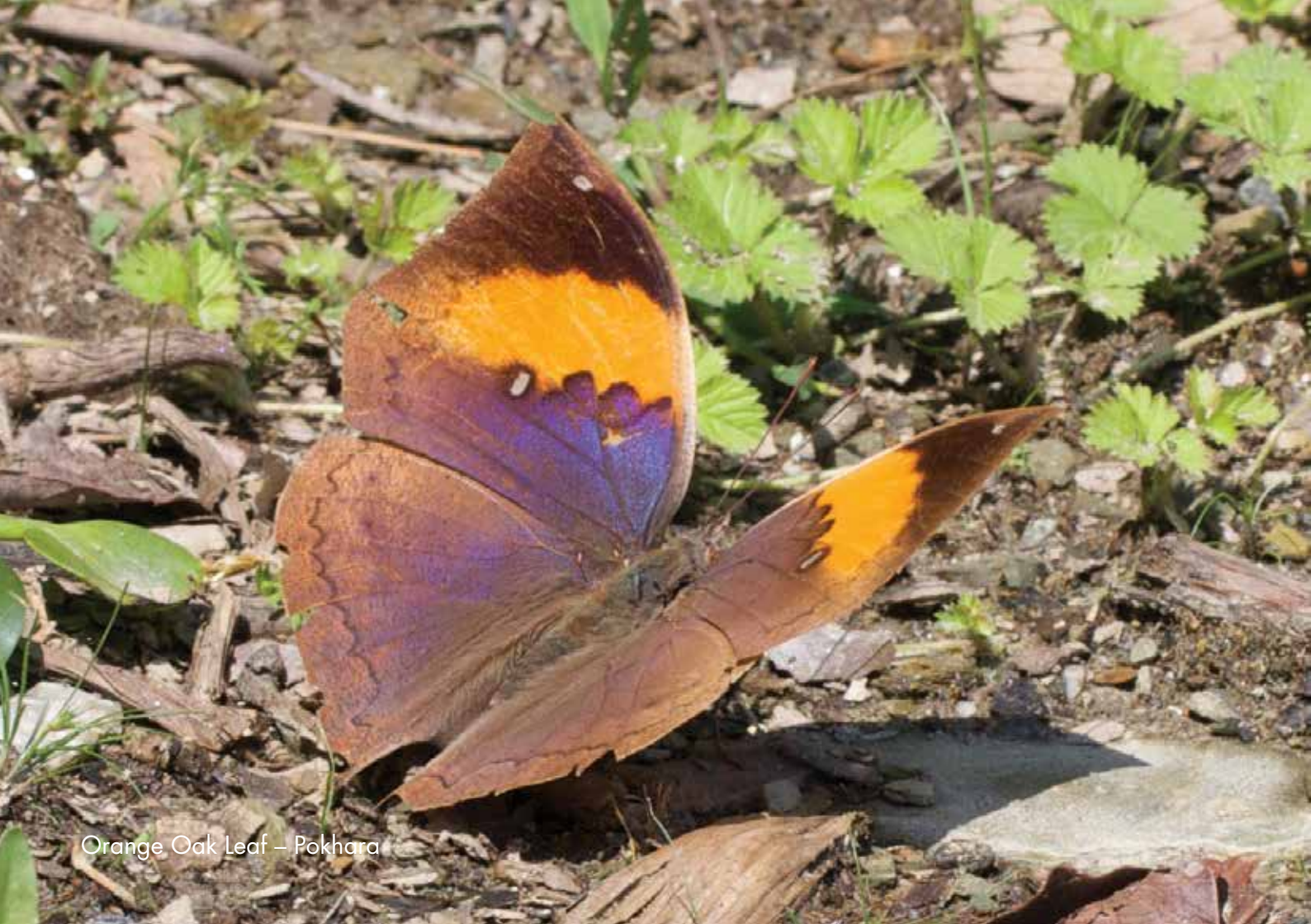
Orange Oak Leaf – Pokhara