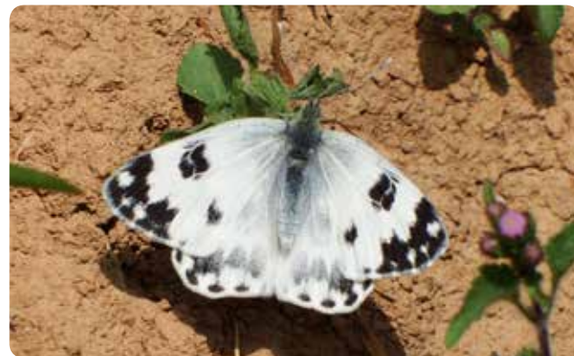
Bath White female