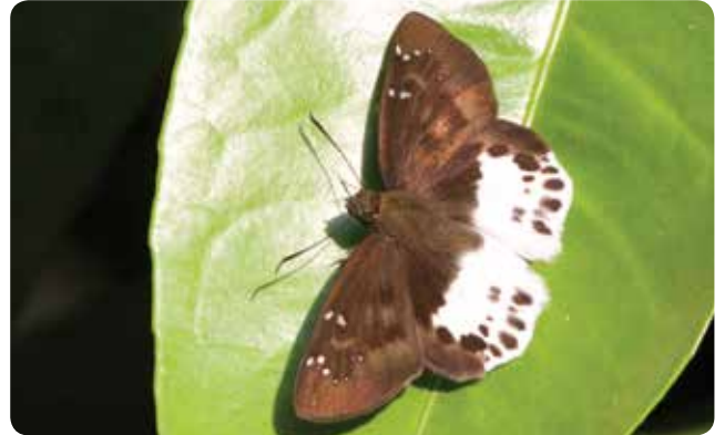
Spotted Snow Flat