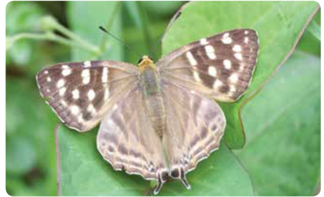
Tailed Punch – inner wing