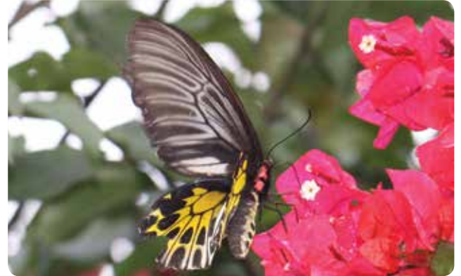
Golden Birdwing Female