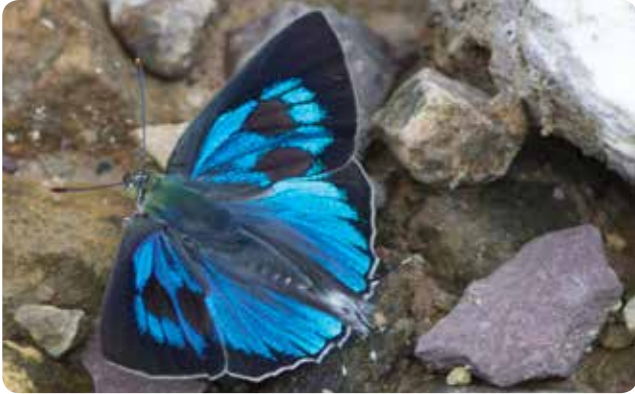
Bispot Royal – inner wing