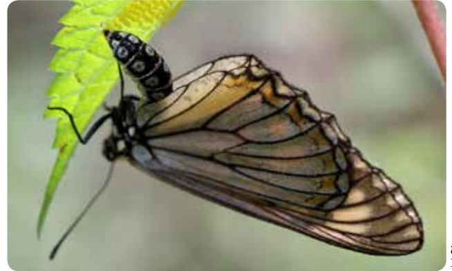
Yellow Coster Female Laying Eggs