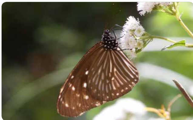
Striped Blue Crow Female