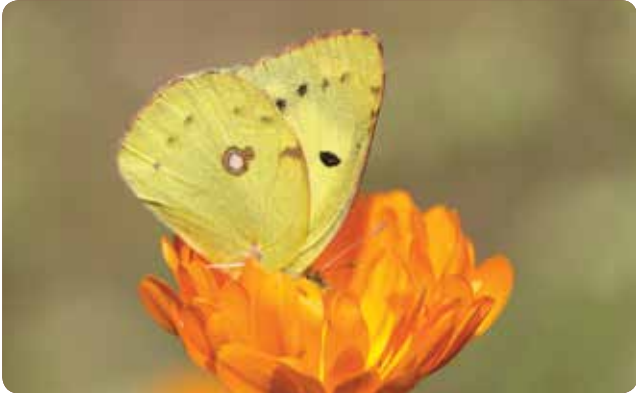
Dark Clouded Yellow