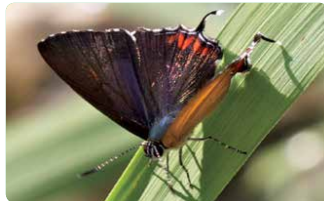
Purple Sapphire – inner wing