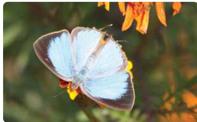
Broadtail Royal – inner wing female