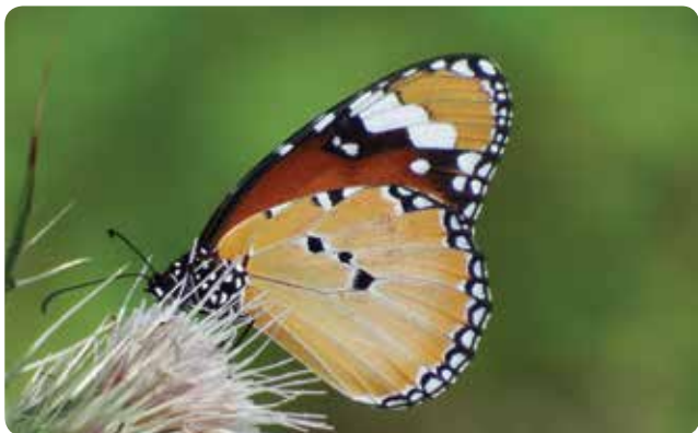
Plain Tiger (male)