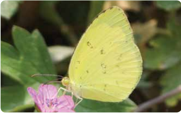
Small Grass Yellow