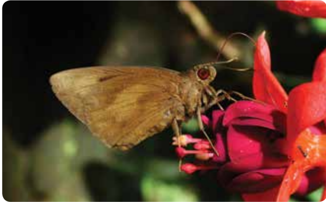
Sikkim Palm Redeye