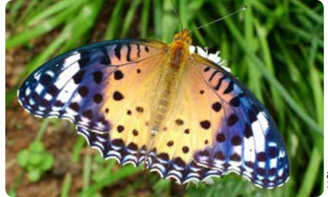
Indian Fritillary female