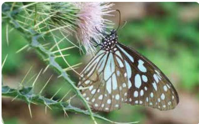
Blue Glassy Tiger