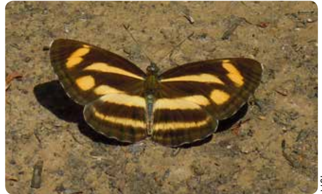
Pale Green Sailor