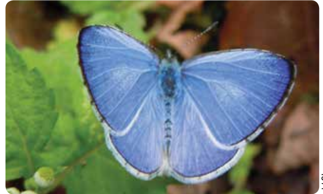
Pale Hedge Blue