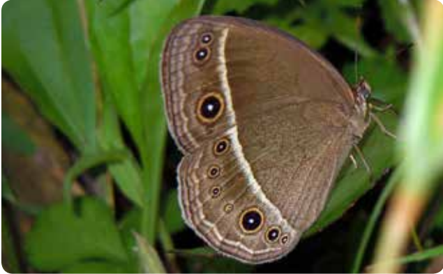
Wood Masons Bushbrown