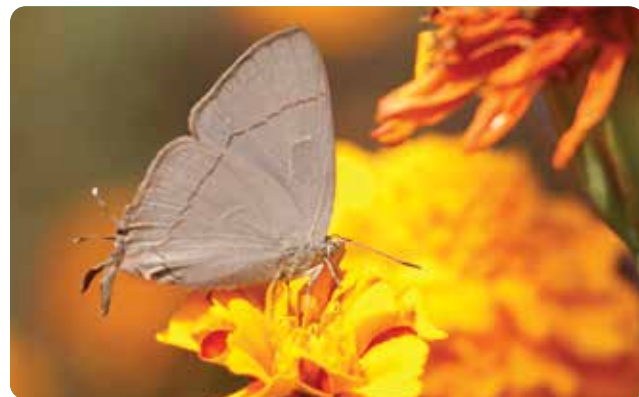
Broad Tailed Royal – outer wing female