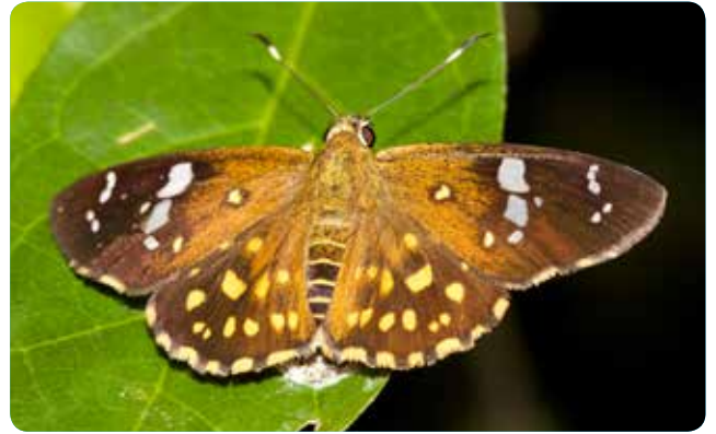
Tytler's Multispotted Flat