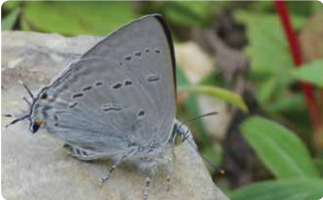
Bispot Royal – outer wing