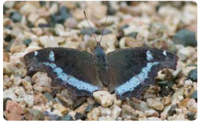
Blue Admiral – inner wing