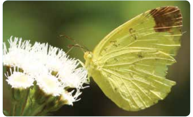
Three Spot Grass Yellow