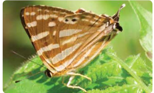
Tailed Punch – outer wing