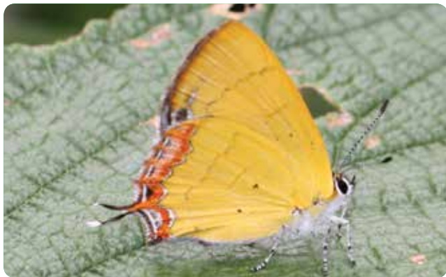
Golden Sapphire – outer wing