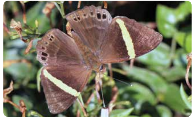
Dark Judy male