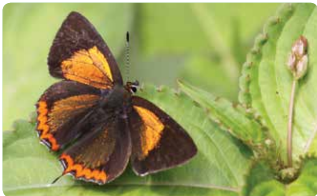
Golden Sapphire – inner wing