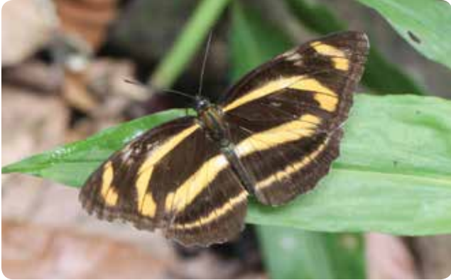
Great Hockey-stick Sailer