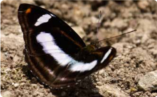
Orange Staff Sergeant