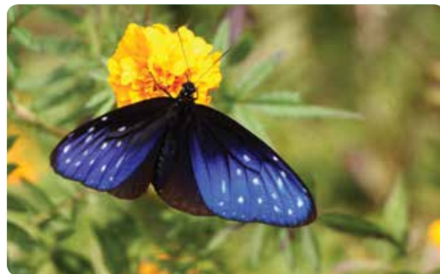
Striped Blue Crow (male)