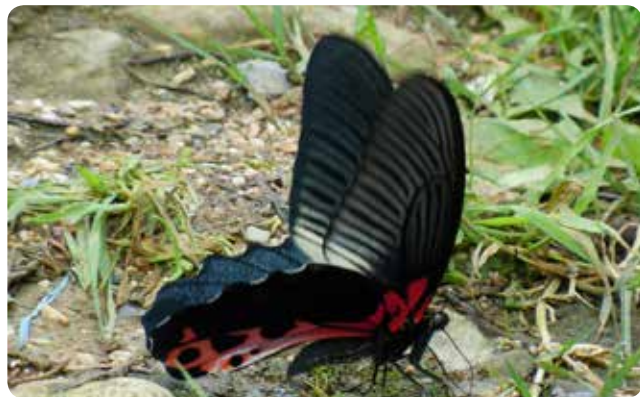
Common Red Breast