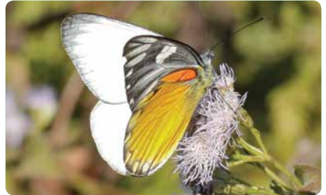
Red Spot Jezebel