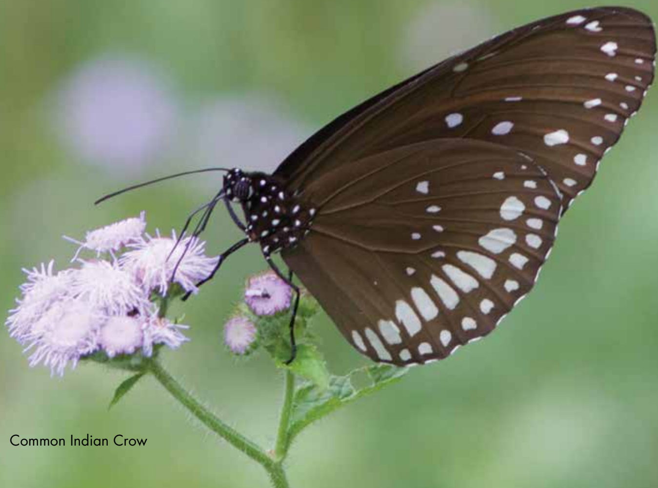
Common Indian Crow