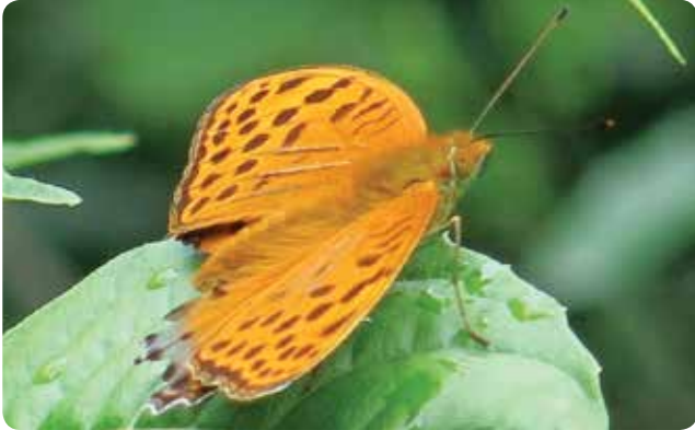
Large Sliver Stripe