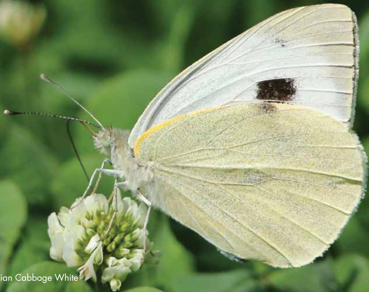
Indian Cabbage White