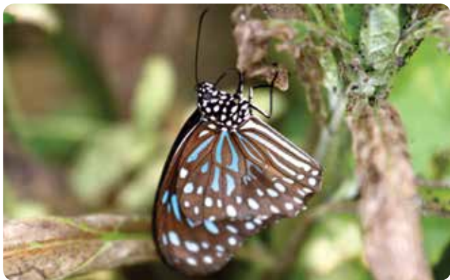
Dark Blue Glassy Tiger