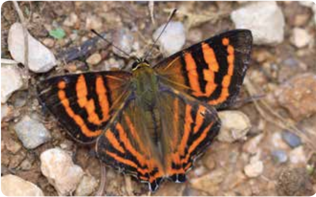
Striped Punch – inner wing