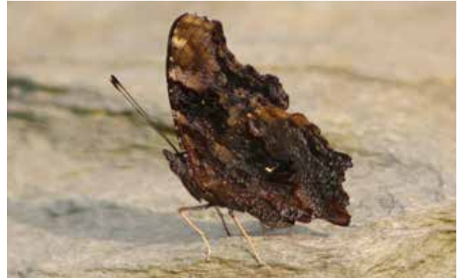
Blue Admiral – outer wing