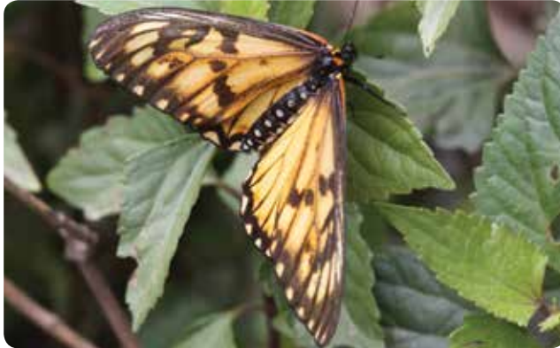
Yellow Coster Female