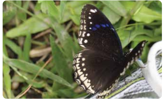
Great Eggfly (female)