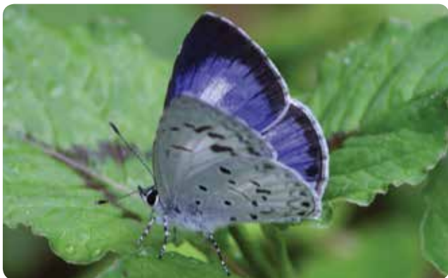
Common Hedge Blue