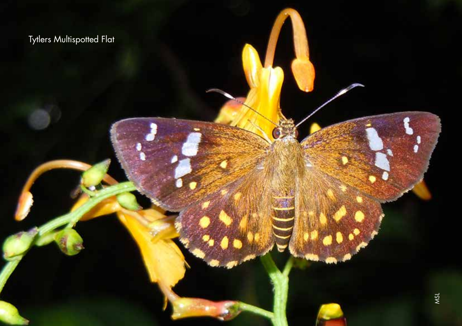
Tytlers Multispotted Flat