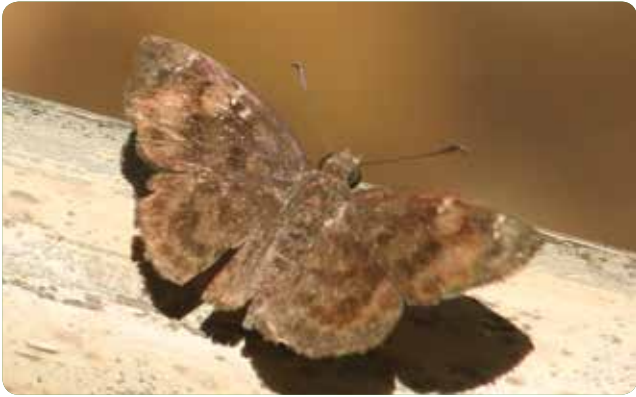
Common Small Flat