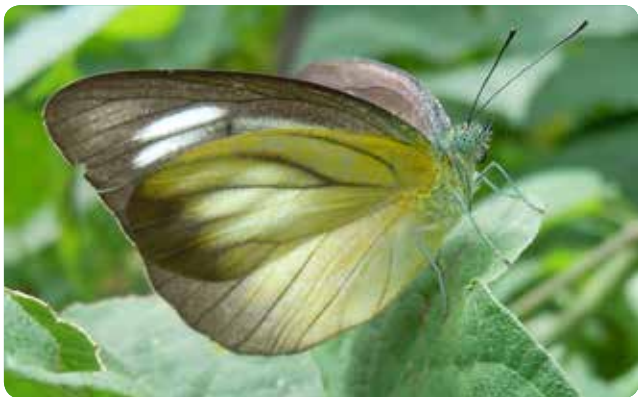
Chocolate Albatross female