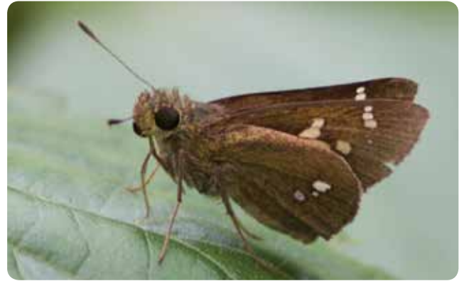
Yellow Spot Swift