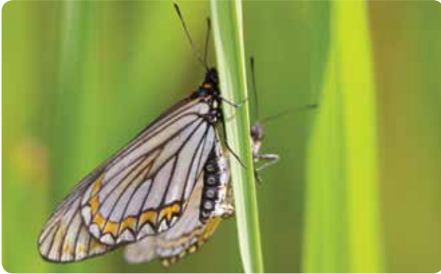
Yellow Coster Male – outer wings