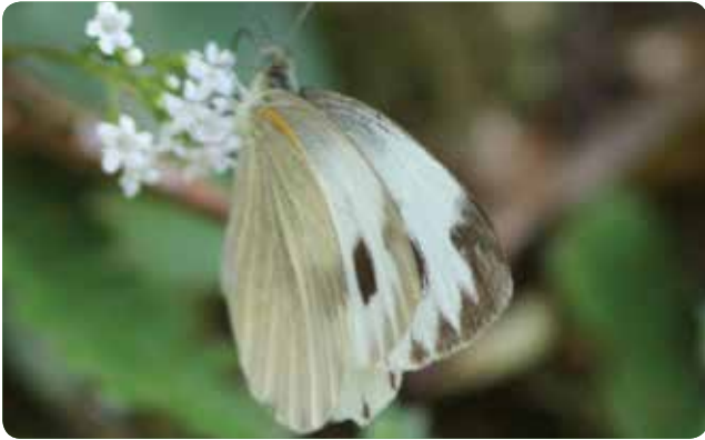
Indian Cabbage White