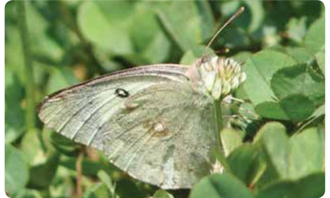
Pale Clouded Yellow