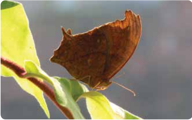
Dark Evening Brown