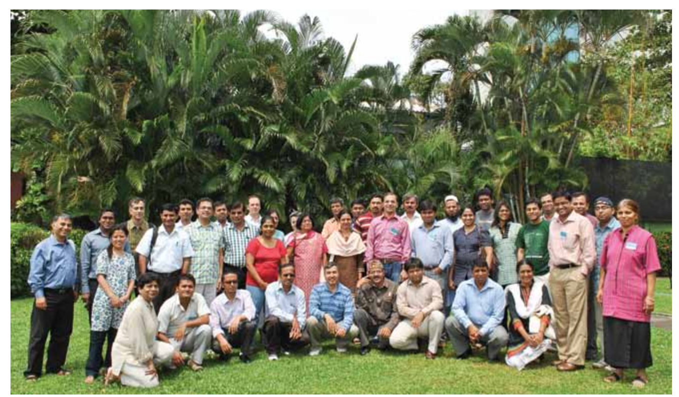
SANDEEites at the 24<sup>th</sup> Biannual Research Workshop in Sri Lanka, June 2012

Answers of the quiz: 1.c, 2.c, 3.a, 4.b, 5.e, 6.d, 7.c, 8.c