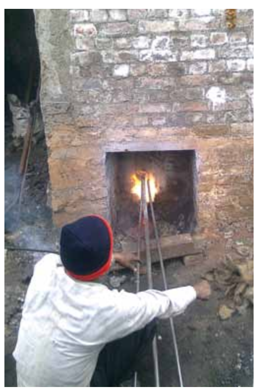
Car battery lead smelting within the informal sector in India

Lead acid batteries generate hazardous waste in the form of lead, with serious environmental and health implications. These batteries are recyclable and the present Deposit Refund System for recycling operating in Delhi provides a discount to consumers when they purchase a new battery and return used batteries to retailers. The retailers in turn determine whether the batteries will be recycled in an environment-friendly or unfriendly manner by selling them to manufacturers or informal sector scrap dealers, who then sell them to un-registered smelters. This study finds that the economic instrument that brings used batteries into the recycling system works exceptionally well. However, organized lead recycling is undertaken only in a limited manner. Rather, retailers prefer to sell used batteries to the informal sector because they obtain higher prices, and incur lower storage costs and taxes. Current rules prevent scrap dealers from selling batteries to regulated smelters. Relaxing these rules would reduce raw material shortfalls currently experienced by the sector and bring more batteries into the formal recycling market. In addition, an alternate policy instrument to consider is a green tax on batteries coupled with a partial or complete refund when the manufacturer ensures environment-friendly recycling.