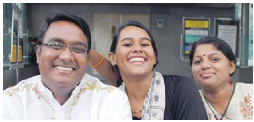
Participants at the Summer School in Environment and Resource Economics, May 2012

resource problems in developing countries. Week 1 of the course covered resource economics, week 2 focused on special topics such as ecosystem services, greening national accounts and common property management, while week 3 was used to impart valuation techniques to participants.