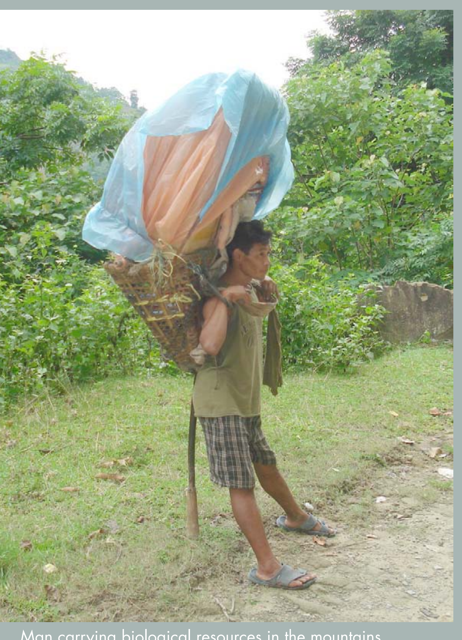
Man carrying biological resources in the mountains