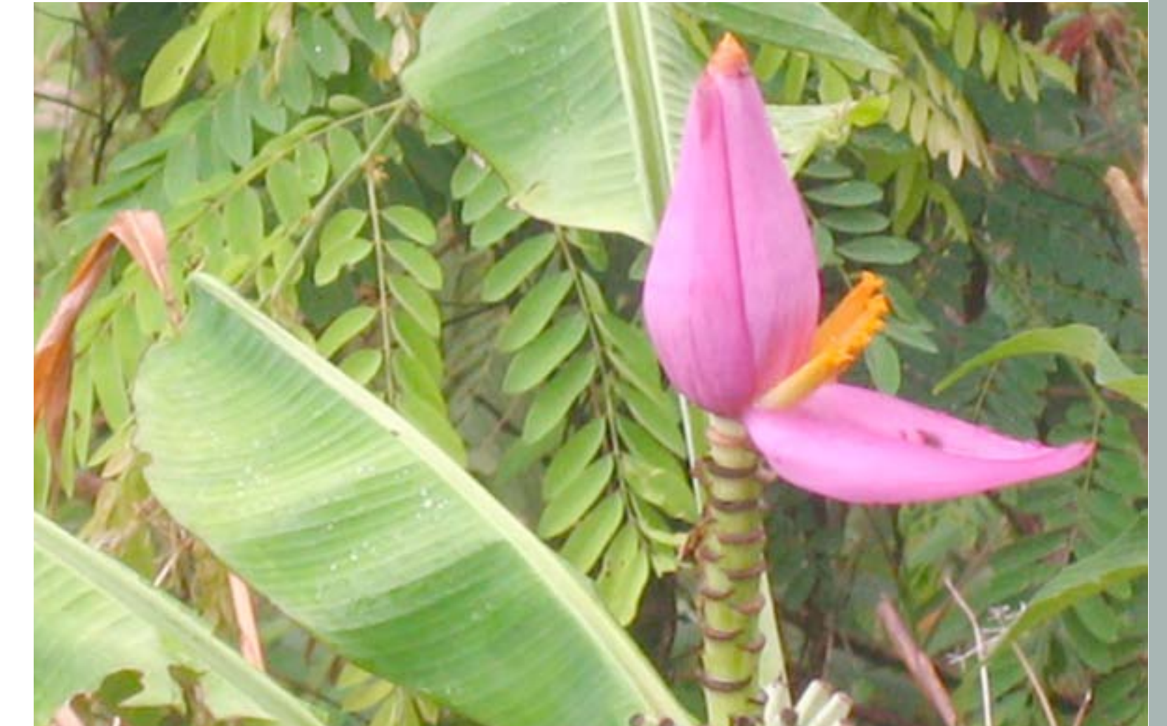
Wild banana in Aarakana mountains, Eastern Himalayas