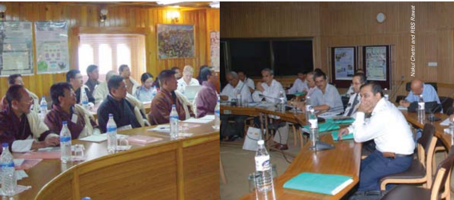
The Bhutan ( left ) and India ( right ) country consultations for the Medium Term Action Plan, 2008/2012