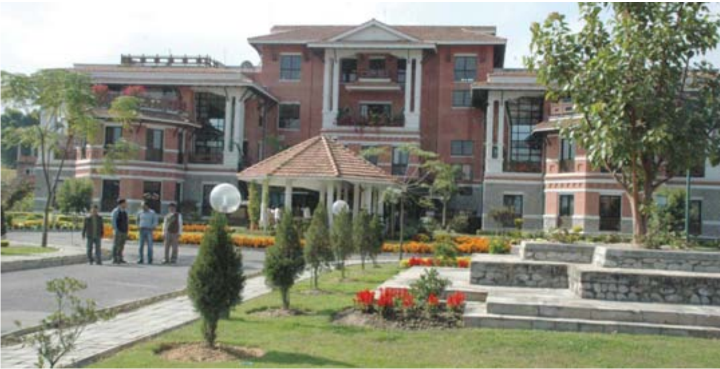
ICIMOD Headquarters in Kathmandu, Nepal