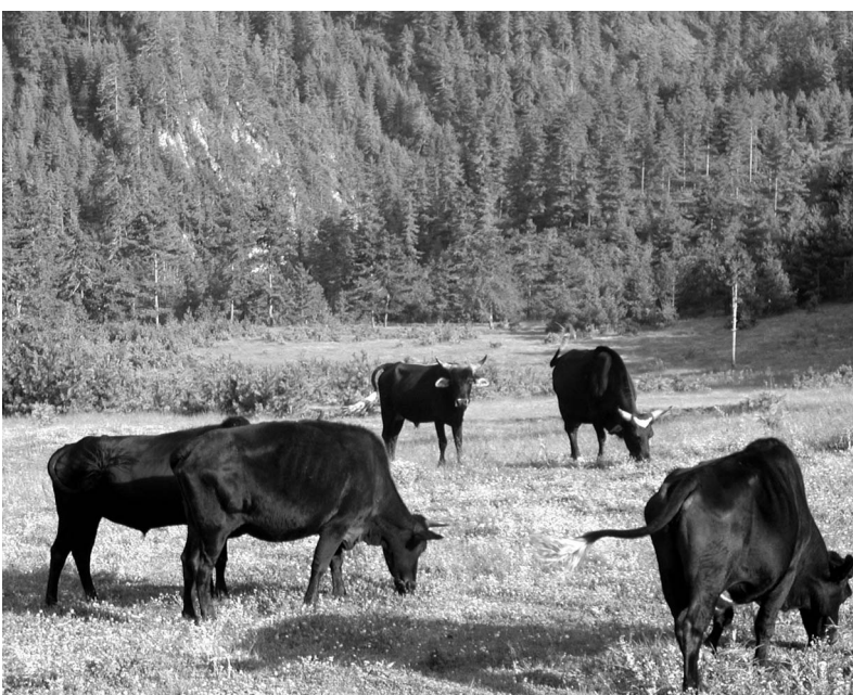
FIGURE 2 Cattle grazing on grassland mixed with blue pine.

Approximately 72.5% of the area of Bhutan is classified as forest. About 27%, or 10,616 km 2 (Land Use Planning Project, unpublished data), of the area is conifer forests (Figure 1), which can be broadly grouped into 6 types (Grierson and Long 1983):