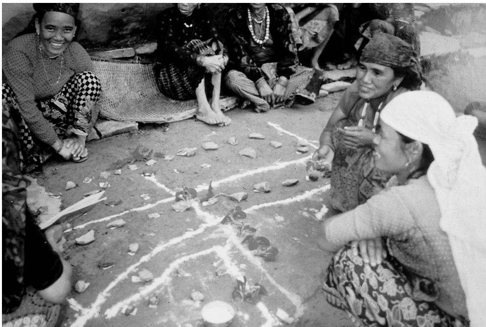
FIGURE 2 Women's knowledge of seed varieties, cultivation, storage, and use is a valuable form of human capital often ignored by policy and decision makers. Here, women construct a "seasonal calendar."

The Kirats, who are one of the oldest ethnic groups in the region, until recently practiced a distinct system of communal land tenure known as kipat . In the decades following a "unification" drive in the mid-18th century to unite Nepal under its present system of monarchs, the Kirats were confronted with numerous challenges to their traditional way of life. The influence of the dominant lowland Hindu groups, combined with the self-interested activities of local headmen or tax collectors ( jimmawal N), led to fundamental transformations of sociocultural practices and land management systems. Extensive areas of forest where traditional swidden practices once dominated were replaced with the ubiquitous rain-fed ( bari N) and irrigated terraces ( khet N) suitable for wetland paddy crops (Sagant 1996; Gurung 1997). Perhaps the most significant outcome of the unification drive was the gradual out-migration of Kirats eastward to Sikkim and beyond because lowland Hindus were actively encouraged to migrate to upland kipat areas (Regmi 1965; Caplan 1970; McDougal 1979). This historical precedent anticipated the increasing trend in out-migration today, with men now seeking employment in urban