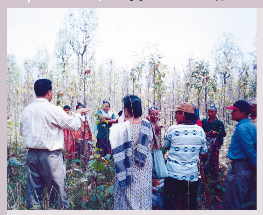
FIGURE 1 Male forester instructing rural women on how to clean the forest. This gendered distribution of roles is still the dominant one in Nepal.

als, at the same time creating conditions under which rural women can demand respect and inclusion by building synergies at various levels. This requires a focus on developing the skills of change agents within communities and agencies.