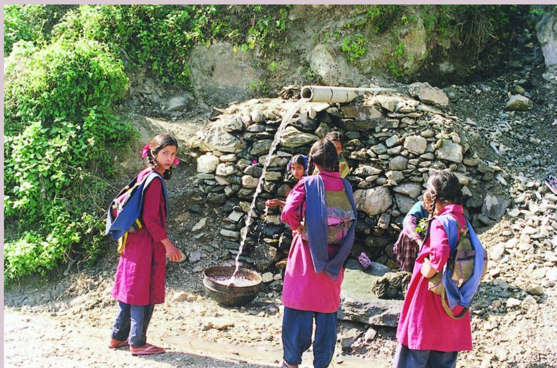
FIGURE 1 Schoolgirls fetching water conducted from a spring by a cement pipe.