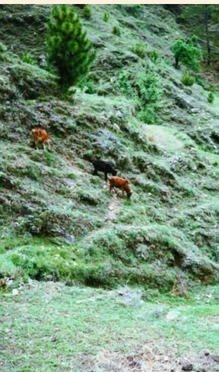
FIGURE 3 Common land under the control of the Revenue Department, Uttar Pradesh Government, 1993.