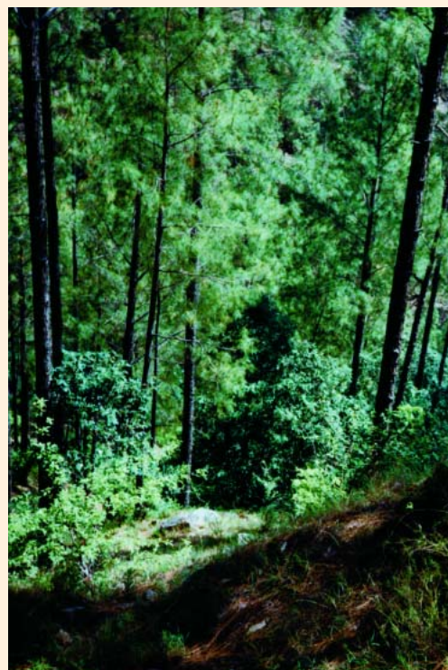
FIGURE 4 Common land under the control of the Forest Council, Almora District, Kumaon, 1993.

households can either monitor each other in the course of performing other tasks or be assigned monitoring responsibilities for a given duration. Under third party monitoring, specific persons have the power to ensure that others are following rules. But the payments for this specialized job can come from several different sources.