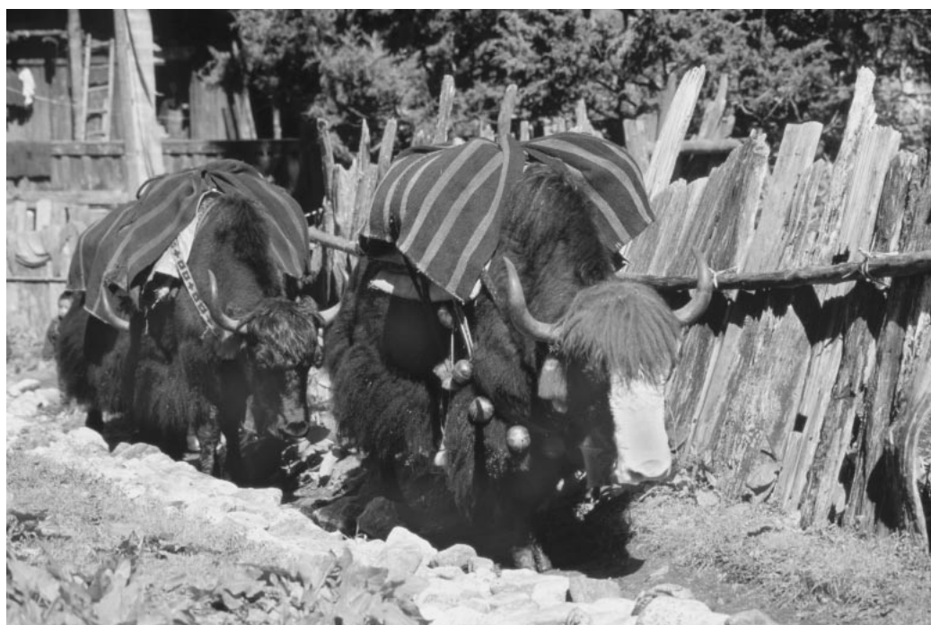
FIGURE 3 Yaks transporting potatoes to the winter settlement at Phale. (Photo by U. Müller-Böker, September 1998)

(non-user-group members) have to pay fees. A healthy population of blue sheep above Khānpāchen (Brown 1994) indicates that the local management of pastures is not only sustainable, but also supports wildlife. Since the refugee residents of Phale do not have pastures or pasture rights, they have a system of coherding with the residents of Ghunsā. In exchange for half the production ( ghiu, churpi ), Ghunsā herders take Phale livestock to their summer pastures. The livestock is kept near Phale in winter. Another group using Ghunsā's pastures are Chetri shepherds from the Taplejuñ area, who practice extended transhumant migration.