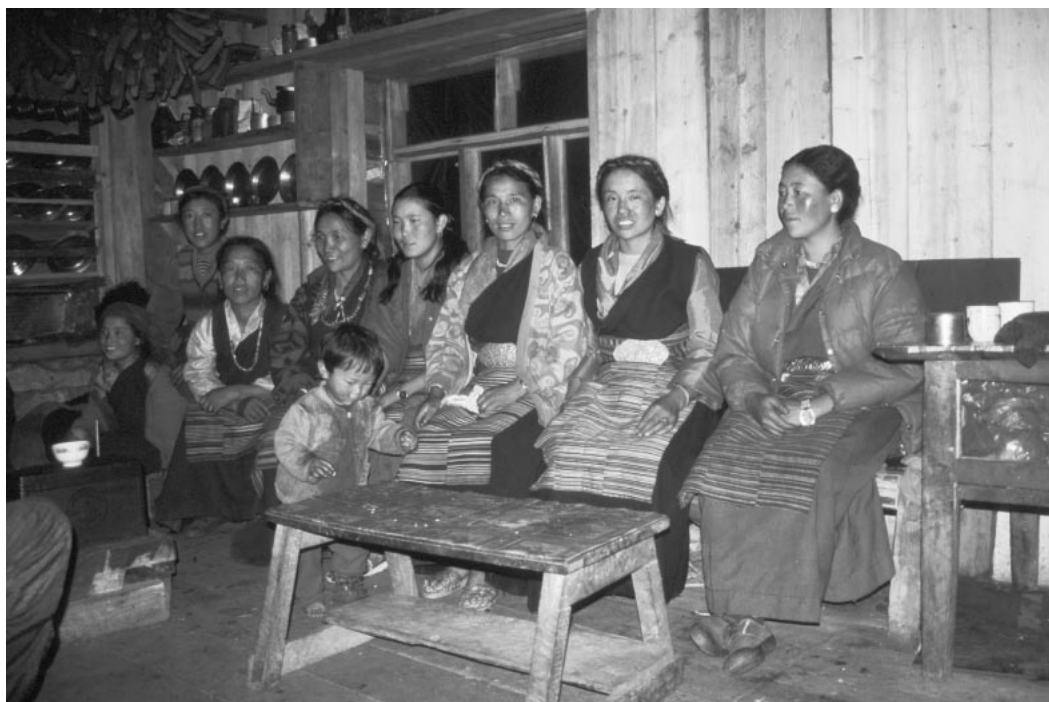
FIGURE 4 A group of women in Ghunsā preparing for a meeting. (September 1998)

against the project, had already led to rumors about stationing of troops, prohibition of forest resource use, and grazing restrictions. The KCAP team had to learn the following lesson: “As a result of misinformation, it was very difficult for the extension team to build trust with the local communities and address conservation issues” (KCAP 1998: 12).