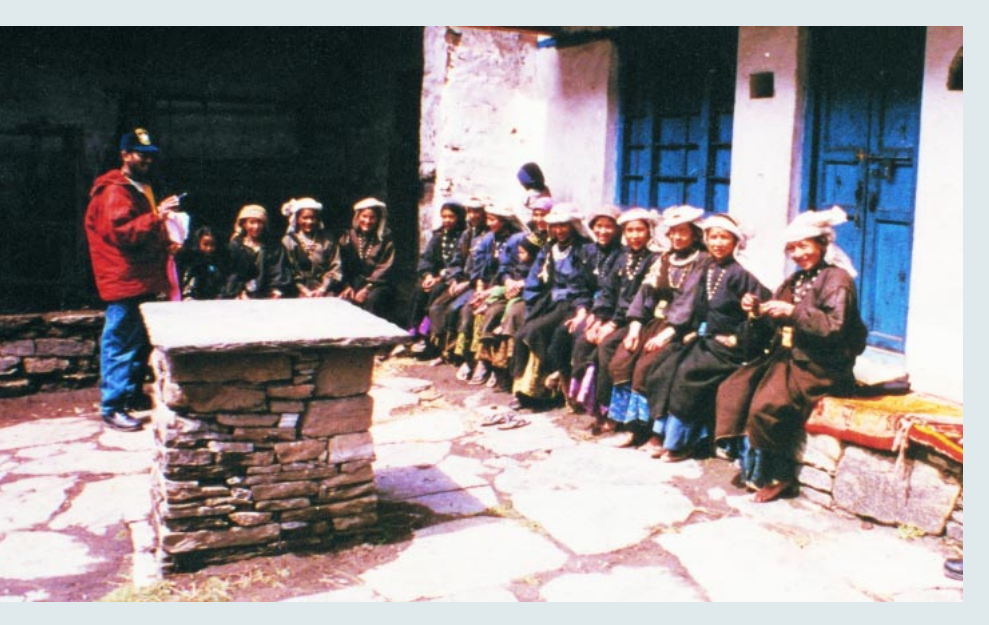
FIGURE 4 A women's self-help group analyzes the impacts of the Reserve on their lifestyles and perceptions.

property and produce due to wildlife depredation (13%). While women (constituting about 10% of those surveyed; see Figure 4) gave loss of subsistence needs as the primary reason (100%), most male respondents (60%) cited loss of economic opportunities (Table 1).