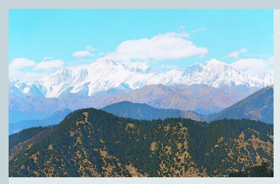
FIGURE 1 Snow-clad mountains with extensive alpine grazing lands constitute the core zone of the Nanda Devi Biosphere Reserve.

economic benefits. The present case study focuses on the issue of crop and livestock depredation by wildlife as a major source of conflict. Feasible solutions in the given socioeconomic context are outlined here; some of these are being tested by the authors in the study area. The results are expected to provide more sustainable livelihood measures and stimulate greater participation in conservation programs.