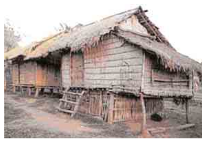
Plate 1: An Alangan Mangyan house

history of the process is given in Box 1. Plate 1 is a picture of a typical dwelling.